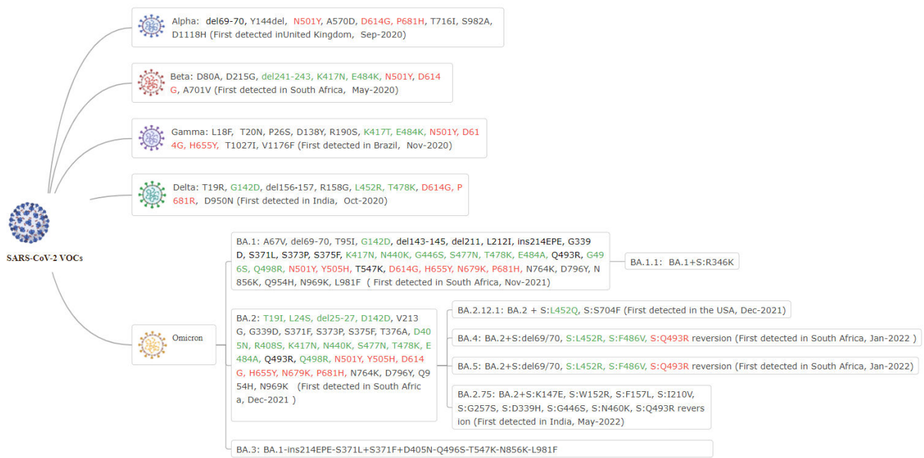
Figure 2. The characteristics of spike mutations of five SARS-CoV-2 variants of concern (VOCs). Notes: Red mutations—these mutations increased the binding affinity and tightness of SARS-CoV-2 spike to ACE2 or increased cell–cell fusion; Green mutations—these mutations reduced neutralization by mAbs, convalescent plasma, and vaccines.

Both pseudovirus experiments and structural modeling indicate that mutations (K417N, N440K [19], G446S, S477N [20], T478K [21], E484A [22], G496S, N501Y [23], Q498R [24], and Y505H, all of which were located in the BA.5 spike) increased the transmissibility of the SARS-CoV-2 variants by increasing the binding affinity and the tightness of RBD to human angiotensin-converting enzyme 2 (hACE2) [25,26] or generated the immune escape of the SARS-CoV-2 variants [27–29], as shown in Figure 3. Additionally, BA.5 has also “H655Y + N679K + P681H” mutations located at the S1/S2 border, which could significantly promote the S1/S2 cleavage and activation of the S protein, thus enhancing viral fusogenicity [30–32]. Compared with the previous VOCs, BA.5 has some unique mutations (S371F, T376A, D405N, R408S, and G446S) that lie at the edge of the ACE2 interaction sites, and these distant mutations reduce the neutralization of Omicron lineages through certain therapeutic antibodies [33–35].