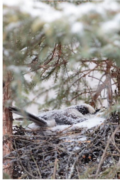
FIGURE 1 Female gray jay incubating during winter in Algonquin Provincial Park, ON.

Our objective was to determine whether ambient temperatures during incubation and nestling periods modulate the effect of timing of breeding on reproductive performance in a population of gray jays ( Perisoreus canadensis , Figure 1) breeding in Algonquin Provincial Park, Ontario. Gray jays are year-round residents of North American boreal and subalpine forests that store perishable food (e.g., berries, mushrooms, invertebrates, vertebrate carrion) during late summer and autumn (Strickland & Ouellet, 2011). Pairs initiate breeding in mid- to late winter, when temperatures are typically below freezing and fresh food resources are scarce (Strickland & Ouellet, 2011). In Algonquin Park, the dominant juvenile of a brood ejects its subordinate siblings from the natal territory in June, ca six weeks after fledging, and typically stays with its parents for the following year, usually dispersing in its second summer (Strickland, 1991). Subordinate juveniles forced to disperse from the natal territory by the dominant juvenile likely have poor first-summer survival but can recruit with unrelated gray jay pairs that were unsuccessful in rearing their own offspring (Strickland, 1991), or attempt to breed.