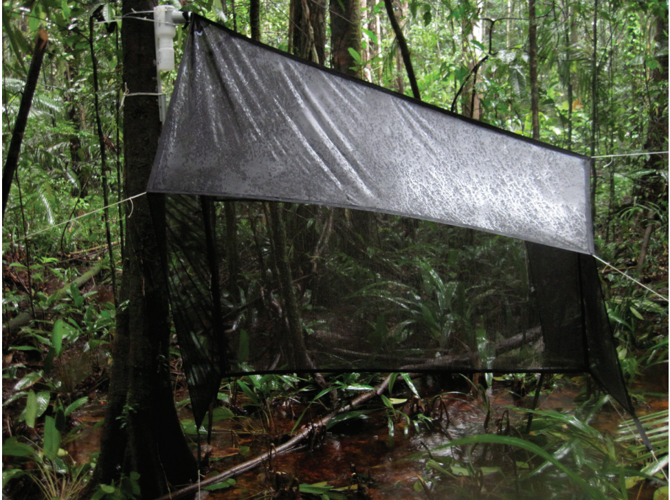
Figure 1. Picture of a malaise trap installed in a flooded forest of French Guiana (Lamarre G).

ameter of the stopper. We recommend the use of a powerful and hermetic glue to affix the stopper inside the gutter hole. Because it is made from lightweight plexiglass, our WT model is also easy to transport and to install. This type of insect trap can be built with low-cost materials. For example, in French Guiana (the most expensive country in the region), we estimate the cost per trap as 90 euros, whereas in Peru the materials to make the trap cost only 40 euros (prices verified in 2011 by the first author).