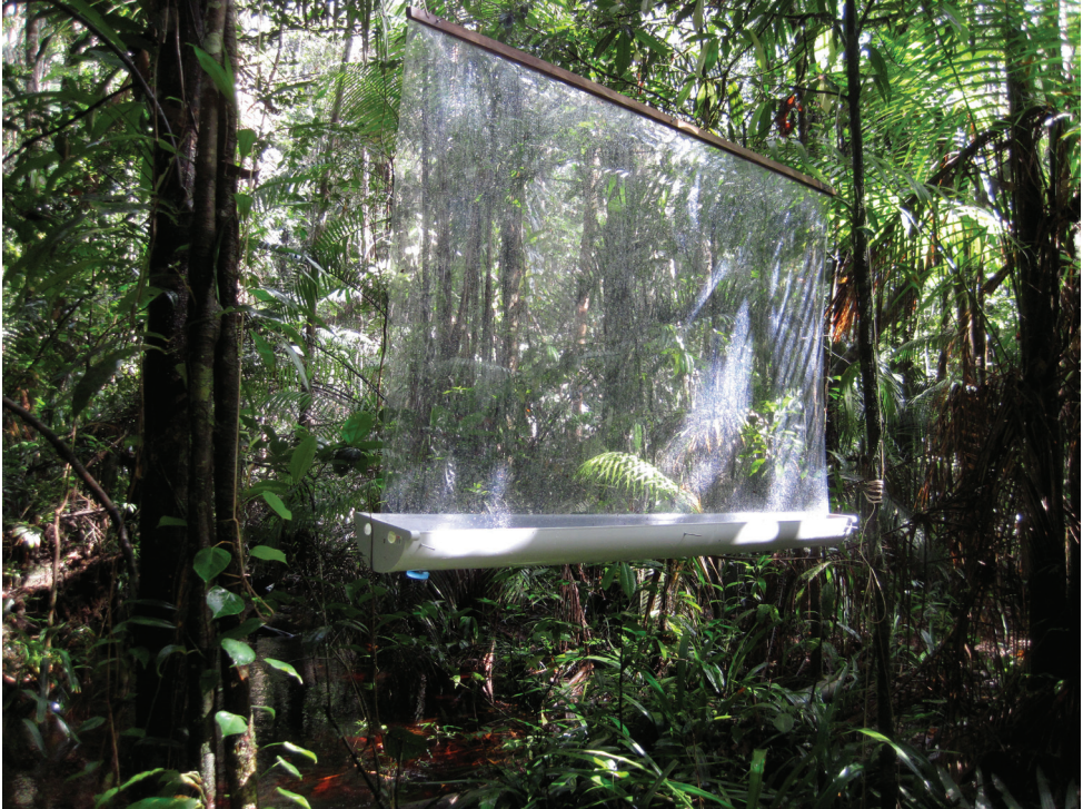
Figure 2. Picture of the modified windowpane trap described in this study (Lamarre G).