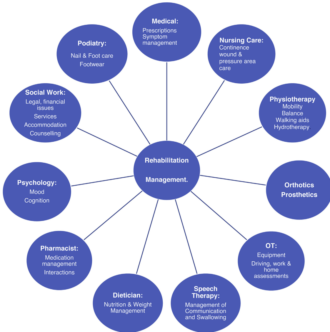
Fig. 3. Rehabilitation interventions. Illustrates various rehabilitation modalities. OT = occupational therapist.

management, psychological counseling, oral and swallowing exercises for head and neck malignancies, and pelvic floor exercises. Most prehabilitation occurs in an outpatient setting.