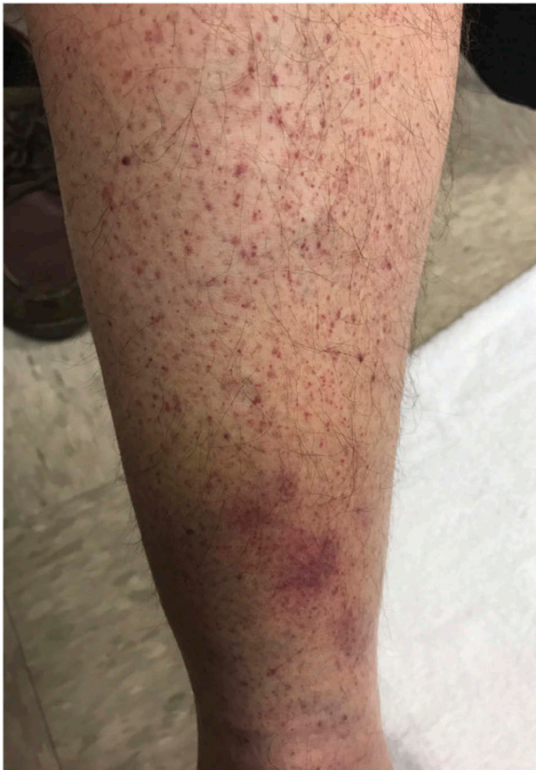
Figure 1. Petechial rash and ecchymosis.