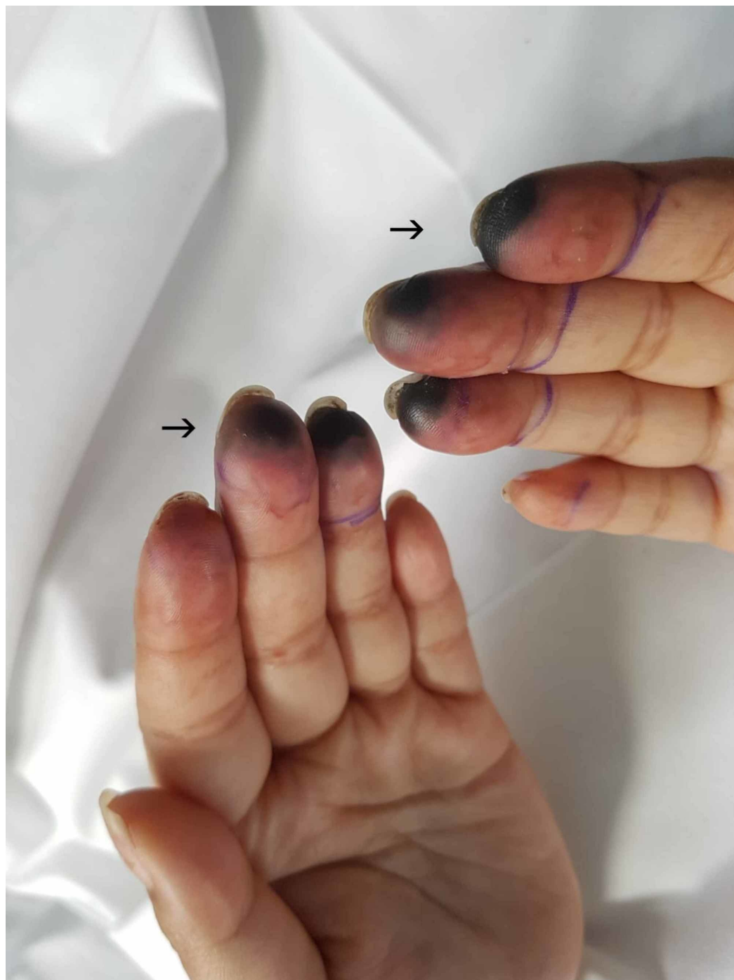
FIGURE 4: Day 5, demarcated areas of dry gangrene to digits

She was extubated on day seven, and by day nine, the patient's platelets had fully recovered and a conservative treatment plan of neuropathic analgesia, prophylactic low molecular weight heparin and daily dressings was implemented, with optimal pain control by the specialist pain team.