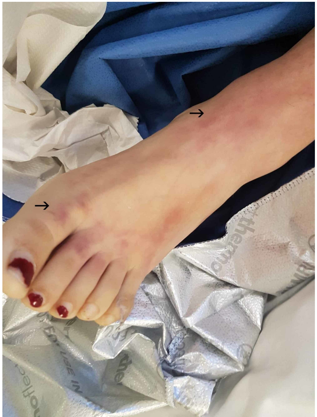
FIGURE 1: Day 2, dusky violet appearance of the right foot, progressed from pallor and cyanosis the previous day

Her platelet count slowly recovered by day three and continuous venovenous hemofiltration therapy was initiated to manage her persistent acidotic state and unresolving anuria. The patient improved significantly over the course of day three and was weaned from vasopressin. Although still intubated, she became more alert and engaged with staff at times. She began to show signs of severe pain in her upper and lower limbs, with a visible extension of the dusky violet to her limbs (Figure 2). Dialysis was ceased on day four and all inotropic support was weaned by day five. Her peripheries deteriorated further with vesicles and bullae developing on her feet by day five. The tips of all 10 digits of both upper and lower limbs had progressed to