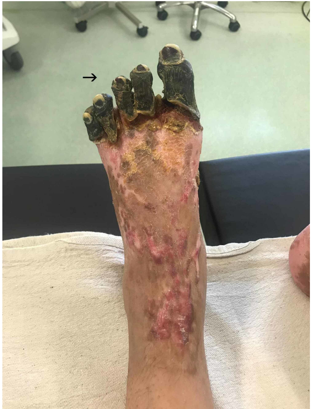
FIGURE 5: Day 70, well-demarcated dry gangrenous area of all 10 digits on the feet

There was total regression of necrotic tissue on all her fingertips by day 70 and the dry gangrenous area of all 10 digits on the feet had become clearly demarcated and ceased to improve (Figure 5).