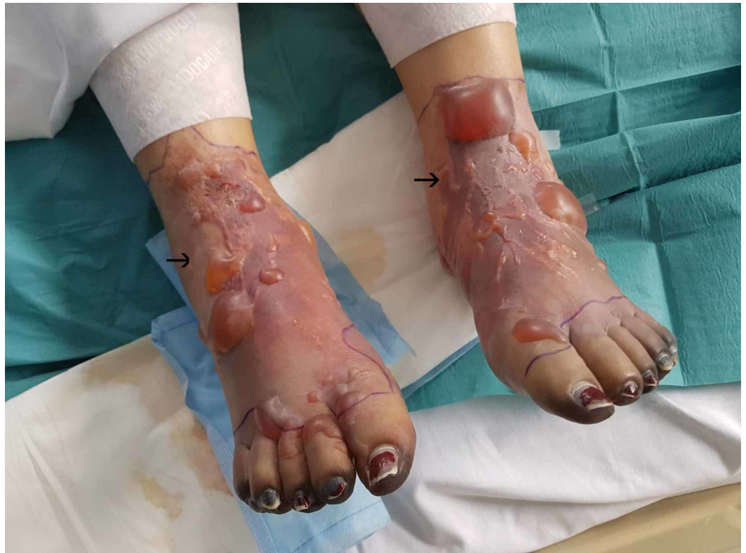
FIGURE 3: Day 5, vesicles and bullae bilaterally on feet, demarcated areas of dry gangrene at the peripheries of all 10 digits