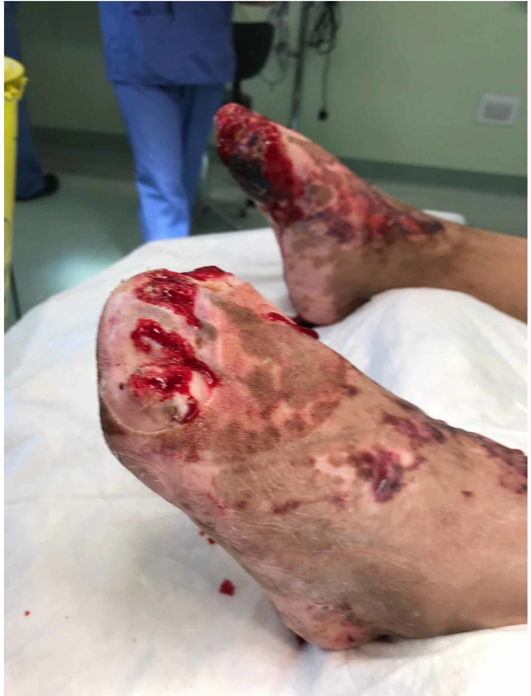
FIGURE 6: Day 73, immediately post amputation of all toes at the metatarsophalangeal joints

metatarsophalangeal joints and a vacuum dressing was applied (Figure 6), as her toes were deemed unsalvageable and became malodorous, suggesting a deep soft tissue infection. She required a total of three further wound debridements under general anaesthetic and application of vacuum-assisted closure (VAC) dressing, as this was deemed unsuitable at a ward level at the present time. At seven weeks post-operative, the dressings were changed on a biweekly basis, with weekly input from the plastic surgery team. She continued with extensive physiotherapy and rehabilitation, and following a full resolution of all infection, underwent a reconstructive free flap three months following her initial amputation procedure.