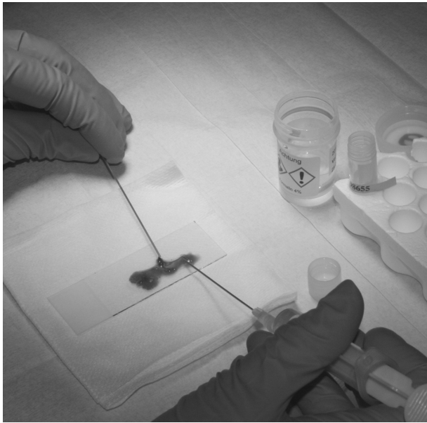
Figure 2 EBUS-TBNA material is placed onto a glass slide, mixed, and divided into two equivalent parts and sent for histopathological and molecular analysis, respectively. The glass slide is then referred to fast track cytological evaluation.

Abbreviation: EBUS-TBNA, endobronchial ultrasound-guided transbronchial needle aspiration.