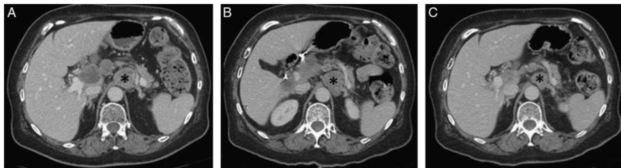
FIGURE 3. Case 2 CT scans over treatment course. A, CT on the start of dual immunotherapy initiated demonstrates multiple enlarged celiac axis lymph nodes, with index lymph node (black *) measuring 32 mm in short axis. B, Three months CT into dual immunotherapy, index lymph node demonstrated a mild increase in the size of 34 mm (black *). C, Despite slight enlargement of lymph nodes, dual immunotherapy was continued as other clinical markers improved, and 6-month follow-up demonstrated decrease in the size of index lymph node to 24 mm, suggesting prior enlargement may have been pseudoprogression.

treatment with this low-dose ipilimumab approach for as long as his response was maintained (Fig. 4).