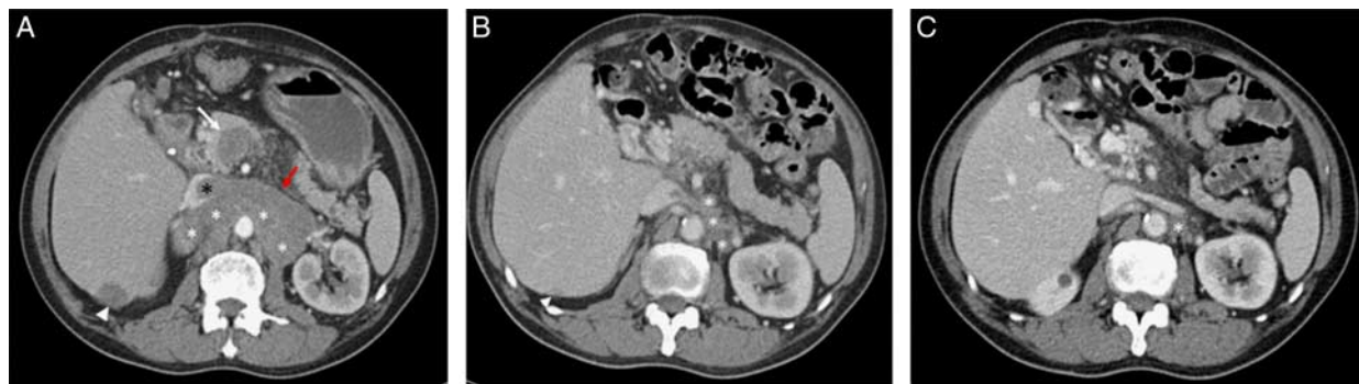
FIGURE 2. Case 1 computed tomography (CT) scans over treatment course. A, CT axial image with intravenous contrast performed 14 months after initial diagnosis and 4 days before dual immunotherapy implementation demonstrates right lobe metastasis (white arrowhead) and retroperitoneal lymphadenopathy (white *) with left renal vein tumor thrombus (red arrow) extending to IVC (black *) and portal vein tumor thrombus (white arrow) extending from peripancreatic lymphadenopathy not included in the image. B, Axial image of CT abdomen performed 19 months after initial staging, and 5 months after dual immunotherapy demonstrates significant interval decrease in size of right posterior liver metastasis (white arrowhead), retroperitoneal lymphadenopathy (white *) and complete resolution of left renal vein and portal vein tumor thrombus with trace residual fibrotic tissue. C, Axial CT abdomen 33 months after initial staging, 19 months after initiation of dual immunotherapy, and 9 months after SBRT to retroperitoneal lymphadenopathy demonstrate further decrease in retroperitoneal lymphadenopathy size (white *), and complete resolution of renal vein and portal vein thrombus. Right hepatic lobe metastasis remained significantly smaller since initiation of dual immunotherapy, and morphologically consistent with posttreatment change (not included in the imaging field). full color online

continued objective response on CT scan on all known metastatic sites (Fig. 2).