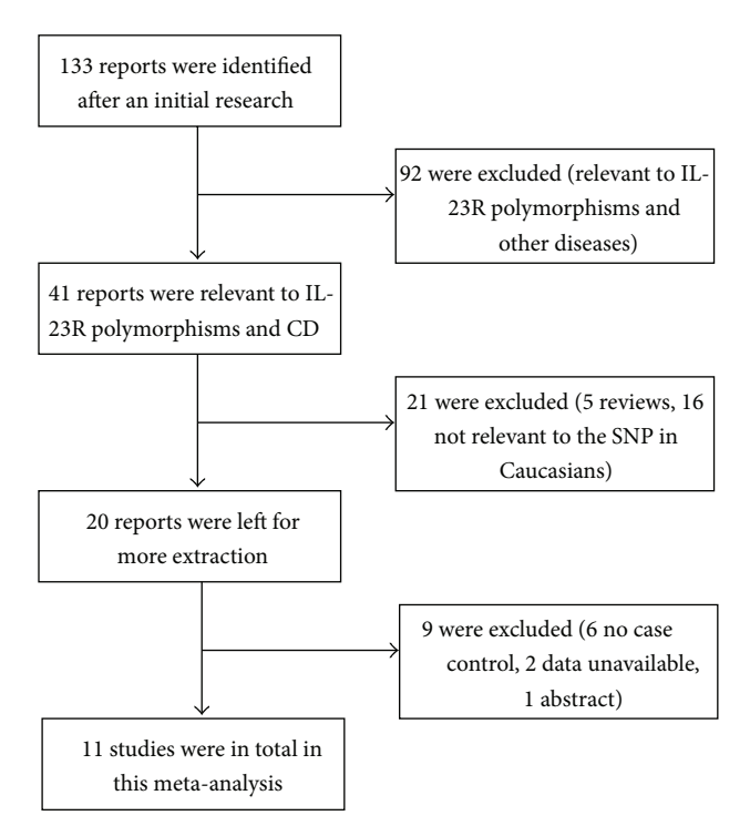
FIGURE 1: Flow diagram of the study selection process and specific reasons for exclusion.

publication; (c) no available genotype frequency; for studies with overlapped or repeated data (d) no Caucasians.