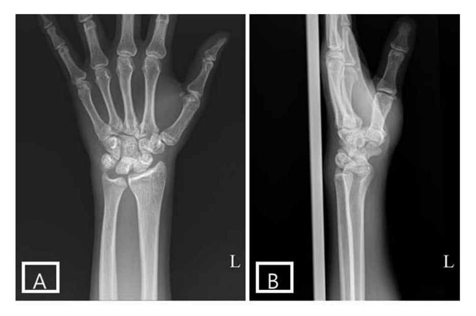
Fig. 4. Twelve-month postoperative plain PA (A) and lateral (B) radiographs showing osseous union and ulnar subluxation of the scaphoid and dorso-ulnar subluxation of lunate, but no evidence of radiocarpal or midcarpal arthritis, and osteonecrosis of the lunate or the proximal pole of the scaphoid.

ray lead to reduction loss and difficulty in preserving the alignment of the dislocated lunate due to the presence of extensive intercarpal ligament disruption. Therefore, complete primary ligament repair through a combined volar and dorsal approach would be required when performing open reduction and internal fixation in such a complicated case featuring extensive ligamentous disruption. However, complete ligament primary repair is difficult because there is severe loss of ligaments and torn ligaments are friable. Therefore, tag sutures or intra-osseous suture using suture anchor is needed for effective ligament reconstruction. In addition, for scaphoid fracture healing, screw fixation using a Herbert or compression screw may be needed for secure fixation. Presently, Kwire fixation was used because of scaphoid fracture comminution.<sup>5</sup> In such a complicated case, some authors advocate consideration of the proximal row carpectomy 10,11 but this procedure may increase instability and herald a catastrophic result. This can be performed as a secondary procedure where all soft tissue injuries have healed or in chronic unreduced carpal dislocations.<sup>4</sup>