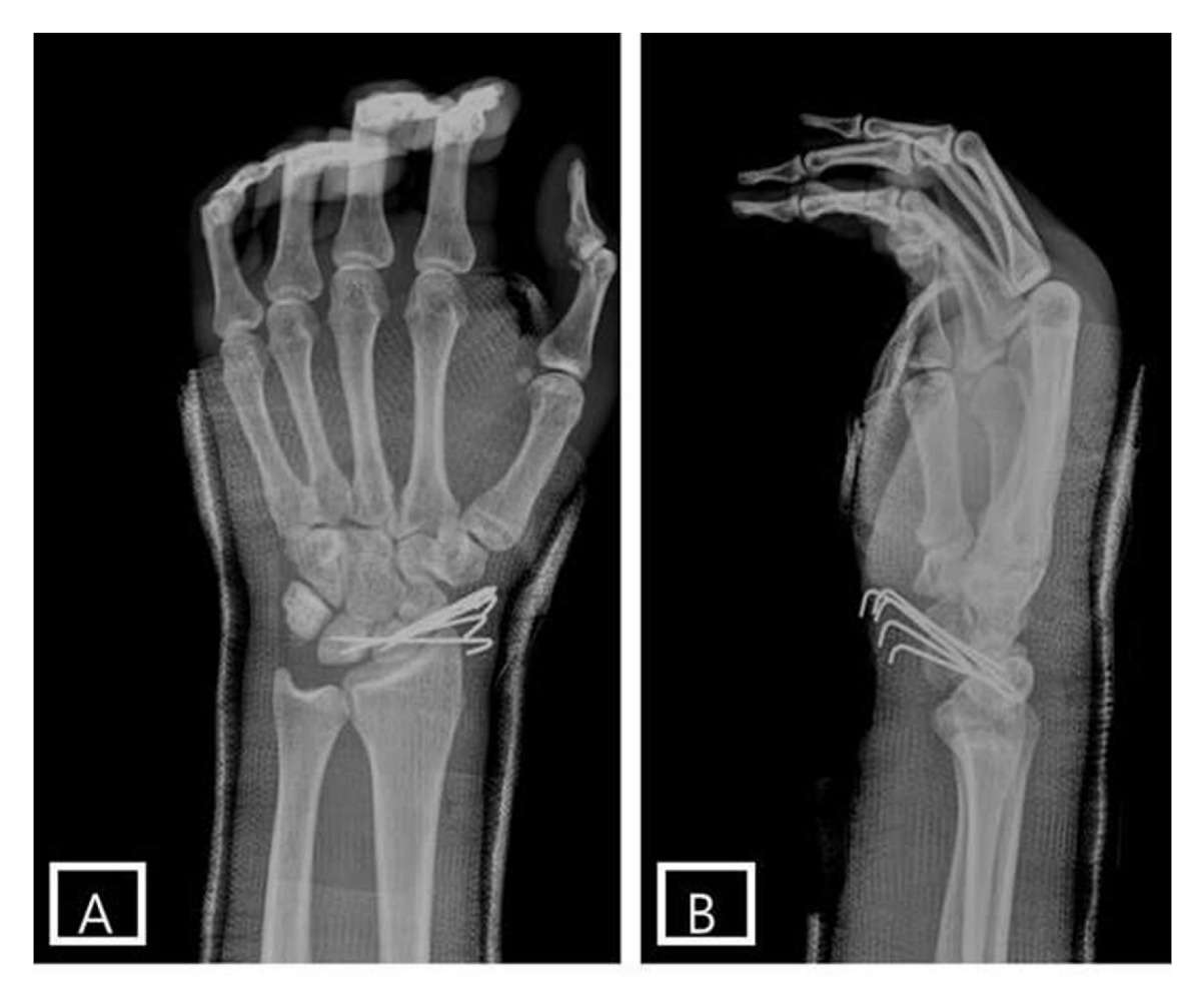
Fig. 3. Immediate postoperative plain PA (A) and lateral (B) radiographs showing the anatomical reduction and percutaneous fixation with Kirschner wires (three 0.045 inch Kirschner wires for the scaphoid fracture, and two 0.045 inch Kirschner wires for the dislocated lunate).

structures, such as scapholunate ligaments, remain intact. Repair of the remaining ligaments may be helpful in reduction and revascularization after surgery.