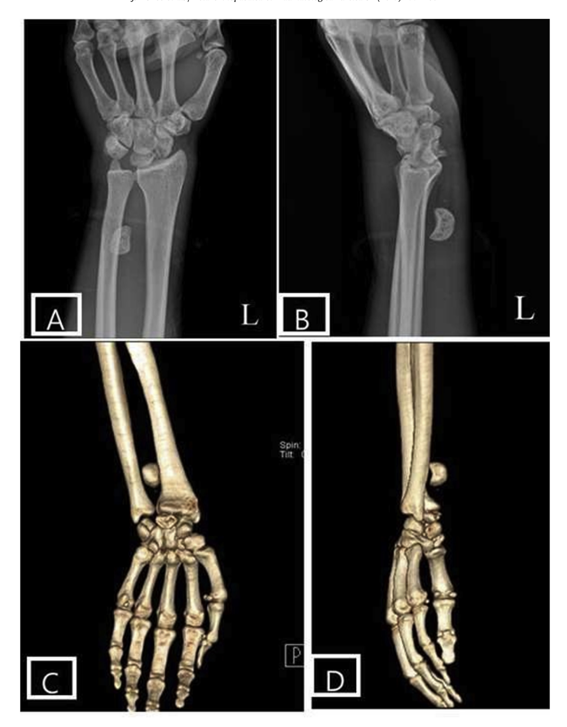
Fig. 1. Plain posteroanterior (A) and lateral (B) radiographs showing the transscaphoid volar lunate dislocation. The proximal fragment of the scaphoid fracture was displaced. The dislocated lunate was located approximately 6 cm proximal to the radiocarpal joint. 3-D Reconstruction CT images (C, D) also showing proximal migration of the dislocated lunate.

40°, and radial deviation was 30°. X-ray examination at postoperative 12 months showed osseous union and ulnar subluxation of the scaphoid and dorso-ulnar subluxation of lunate, but no evidence of radiocarpal or midcarpal arthritis, and osteonecrosis of the lunate or the proximal pole of the scaphoid (Fig. 4).