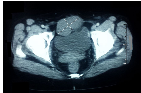
Fig. 2 Computed tomography showing the abdominal wall recurrence

The multidisciplinary meeting decided to perform a diagnostic and therapeutic laparoscopy. The laparoscopic exploration showed a 70 mm tumor of the small bowel, 70 cm upstream the last ileal loop. The tumor was extracted through a small suprapubic incision, without the use of a wound protector. It was resected with a safety margin of 2 cm and an end-to-end anastomosis was performed. The postoperative course was marked by an infection of the extraction's site. The pathology specimen findings revealed a stromal tumor with a high aggressive potential (five mitosis per field), positive to CD117 at the immunohistochemical examination. An Imatinib adjuvant therapy was indicated, but the patient did not receive it because of financial considerations.