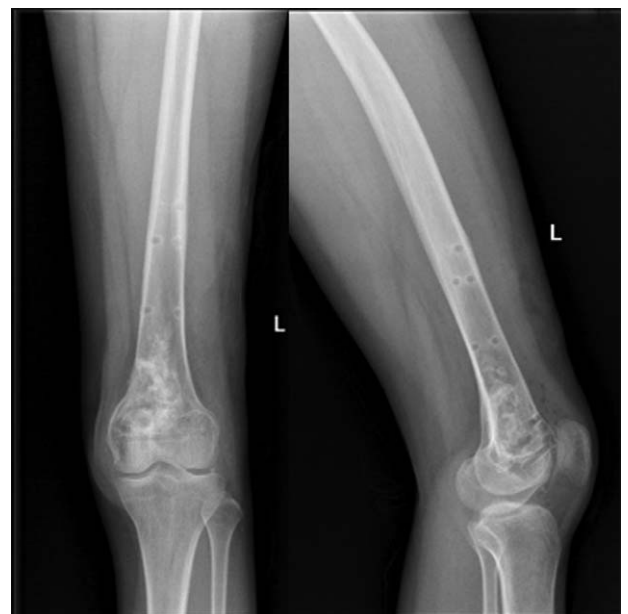
Figure 6. The patient was admitted to hospital to remove the internal fixation in January 2015.

The treatment of osteosarcoma has progressed over time. In the 1970s, the standard treatment was amputation. Amputation is one of the most important methods in the early stage of