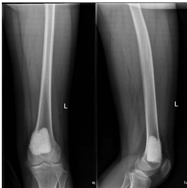
Figure 4. The patient underwent left distal femoral tumor tumorectomy with bone cement implantation in February 2010.

to remove the internal fixation (Fig. 6). Radiography of the left femur revealed no obvious abnormalities in the bone and surrounding soft tissue. The patient was doing well with no evidence of local or distant recurrence 7 years after the surgery (Fig. 7). Approval for this study was obtained from the ethical review board of ethical committee of The First Affiliated Hospital