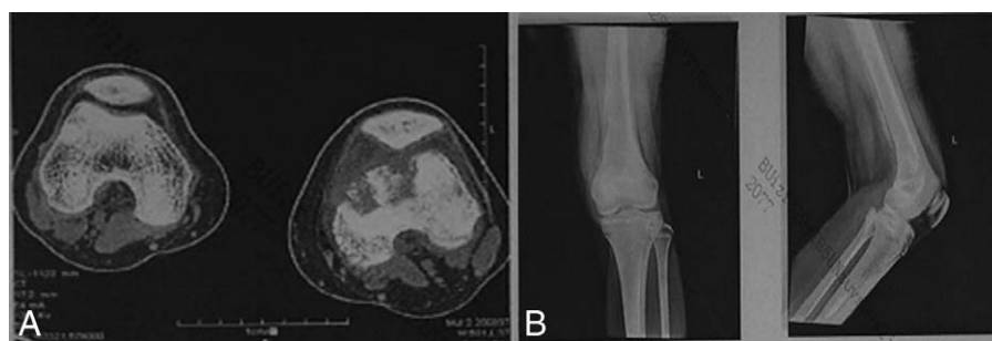
Figure 1. Computed tomography and radiographic examination of the left femur showed bone destruction, suggesting that a malignant tumor was present.

salvage. It had a very good therapeutic effect on malignant bone tumors and a strong destructive and adjuvant treatment effect. However, 80% of patients had a small metastatic interval at the time of diagnosis. The average time from surgical treatment to pulmonary metastasis was 8 months, and the overall survival rate for amputation was 10% to 20%. [2–4] Most patients died within 1 year after diagnosis. [5] This shows that the outcome of amputation is not optimistic; therefore, there is an urgent need for better treatment.