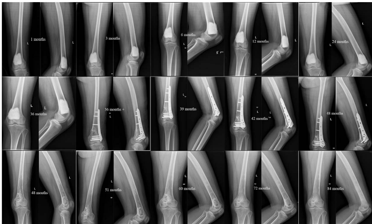
Figure 7. Seven-year follow-up imaging data.