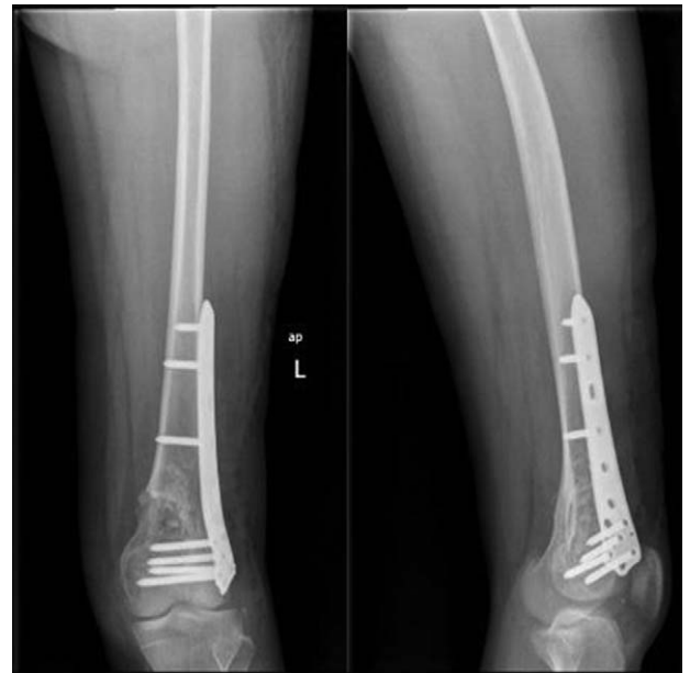
Figure 5. The patient underwent bone grafting and internal fixation of the distal femur in June 2013.

of Nanchang University, and all the investigations were conducted in conformity with the research principles of the ethical committee of The First Affiliated Hospital of Nanchang University. Informed consent was obtained from the patient for publication of the report and the accompanying images.