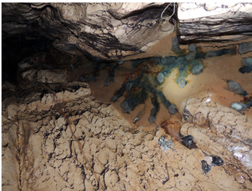
Figure 2. Picture of dead bats found in the Tkibula-Dzevrula cave.

At the end of April 2018, we were informed by a local speleologist about a die-off of bats in the cave and 20 dead bodies were collected and kept frozen until transport to the National Center of Diseases Control and Public Health (NCDC) in Tbilisi. The carcasses were morphologically identified by species.