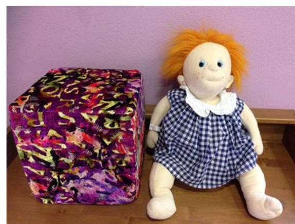
Fig. 2 The doll and the soft cube

The object (doll or cube) presentation procedure will be structured in five standard steps as follows: