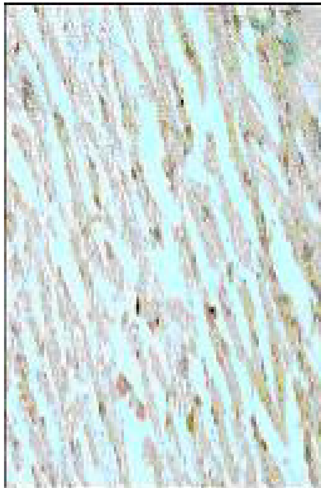
Figure 9 Ocimum sanctum (75 mg/kg) treated group subjected to 45 min of ischemia and 1 h of reperfusion failed to significantly decrease TUNEL positivity as compared to control IR group.

Microscopic histology revealed that the non-infarcted myocardium in the sham group was characterized by an organized pattern and shows normal architecture of the myocardium (Table 2). Contrastively, on histological evaluation, rat hearts, subjected to I-R (Control IR) demonstrated marked edema, confluent areas of myonecrosis, myofiber loss and mild inflammation as compared to those in the sham group (Table 2). Cl (100 mg/kg) treated rats demonstrated marked structural improvement specially with regard to the degree of myonecrosis, infiltra-