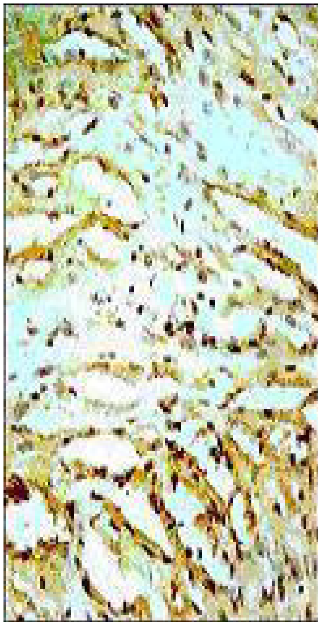
Figure 3 Ocimum sanctum (75 mg/kg) treatment did not result in significant alteration in the expression of Bax protein versus the control IR group.

The baseline value of LVEDP in the Cl treated group was 3.4 \pm 0.25 mm Hg (Fig 5). Cl treatment significantly corrected the elevated LVEDP levels at 15 min ( p < 0.001 ), 25 min ( p < 0.01 ), 35 min ( p < 0.05 ) and 45 min ( p < 0.001 ) as compared to control IR values. Thereafter during the reperfusion duration the value of LVEDP in the Cl treated