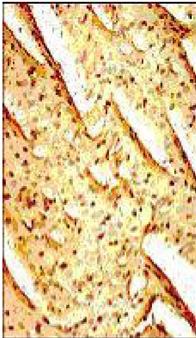
Figure 5 Curcuma longa (100 mg/kg) upregulated Bcl-2 protein as indicated by dark brown positive immunoreactivity compared to control IR group.

parison to sham. However, in the Os treatment group the value of LVEDP was significantly lower at 15 and 45 min of ischemia ( p < 0.01 ) as compared to control IR values at the same time points. Post reperfusion the LVEDP values in the Os treated group were comparable to control IR values.