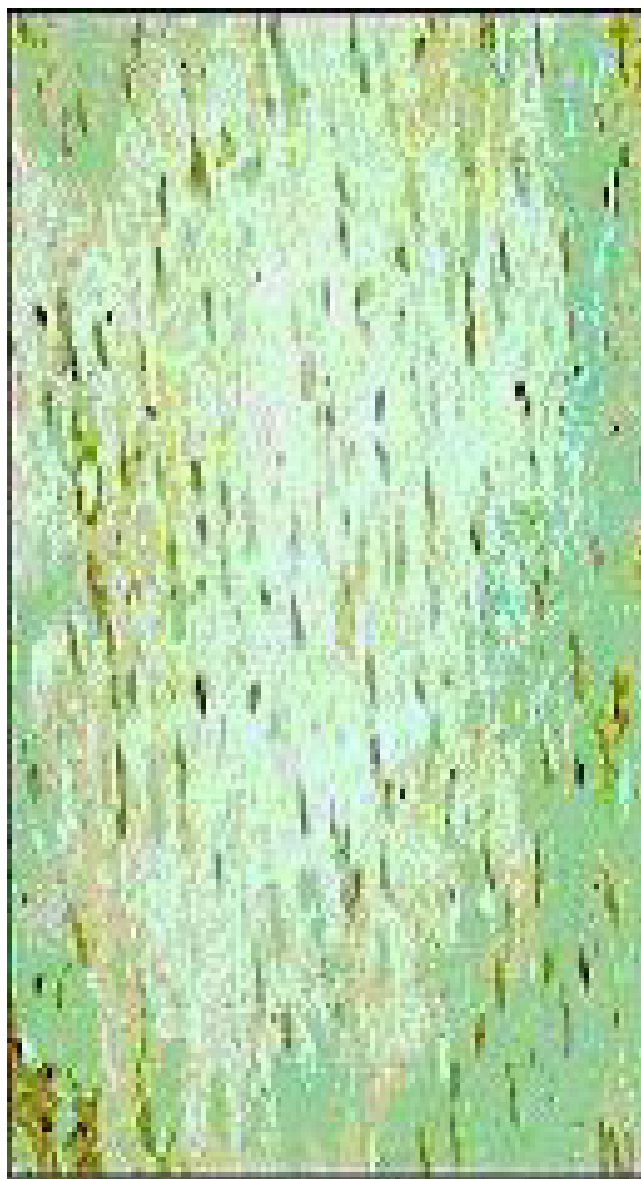
Figure 2 Curcuma longa (100 mg/kg) significantly attenuated the expression of Bax protein versus the control IR group.

The MAP recording in the Os treated group, before LAD coronary artery ligation, was 123 \pm 11.9 mm Hg (Graph