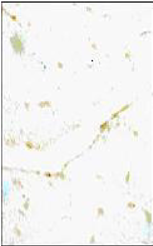
Figure 8 Relative to the control IR group the number of TUNEL positive cells was significantly decreased by treatment with Curcuma longa (100 mg/kg).

TUNEL positive cells in the Os-IR was found to be 2.4 \pm 0.09\% .