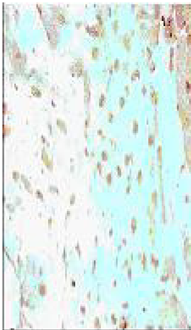
Figure 7 Representative photomicrographs of ventricular tissue stained for nick-end labeling (TUNEL) for DNA breaks. In the Control IR group a large number of TUNEL positive cells are observed subsequent to ischemia and reperfusion injury. Figures are representative of at least 5 separate experiments.

TUNEL positivity was expressed as percentage of total normal nuclei. Slight TUNEL positive staining was detected in the sham group ( 0.2\% \pm 0.01\% , Table 1). However, the