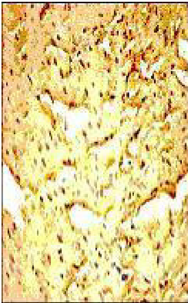
Figure 4 Representative photomicrographs of ventricular tissue stained for Bcl-2 protein. Coronary occlusion and reperfusion resulted in a slight reduction (non significant) in Bcl-2 expression in the control IR group compared to non-ischemic tissue. Figures are representative of 5 separate experiments.