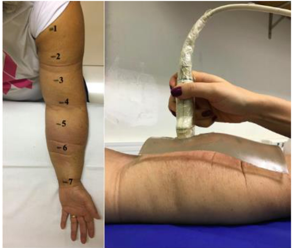
Fig 1. a) Illustrative image of the points used for elastography; b) Placement of the US pad and transducer.

https://doi.org/10.1371/journal.pone.0264160.g001