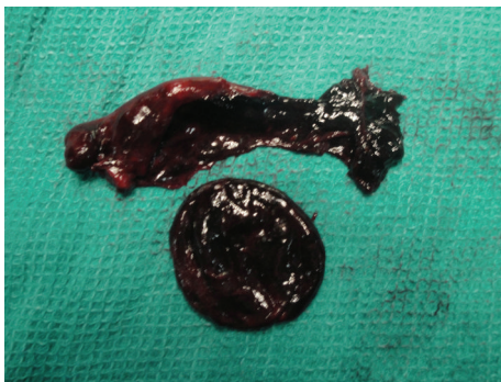
FIGURE 2: Left fallopian tube with paratubal cyst.

asymptomatic [1]. However, these are uncommon in children. Hemorrhage, rupture, and infertility are rare complications and occur in large cysts. IFTT has been reported in with unilateral [4] and bilateral [5] paratubal cysts in older children. Small cysts (<3 cm) may be punctured and larger ones excised. Malignant neoplasms arising from paratubal cysts are very rare [6]. Regular followup with abdominal sonogram is advisable.