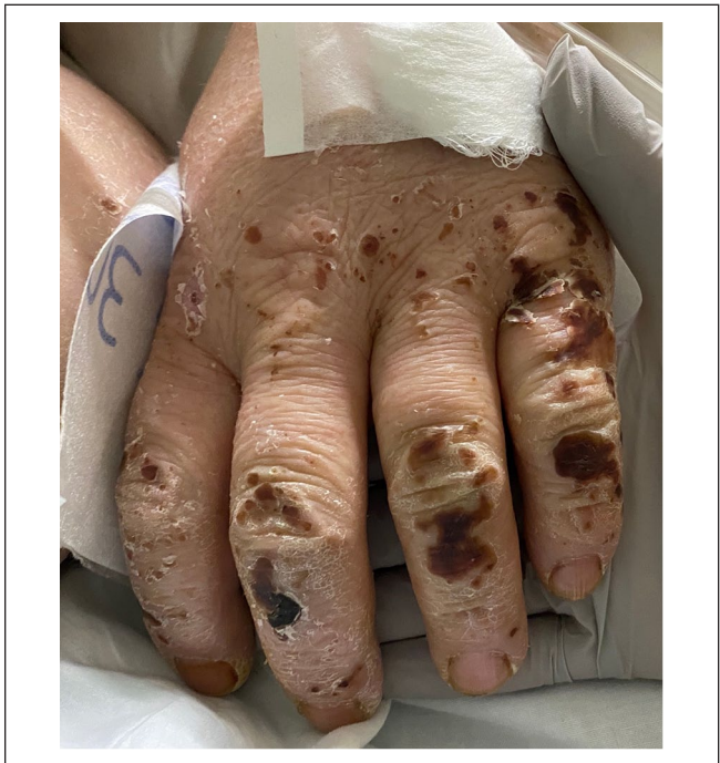
Figure 2. Palpable lesions on the dorsum of the hand.

myalgias, and dry skin. In rare cases, patient may have vasomotor instability leading to death. 3