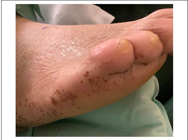
Figure 1. Petechiae on the plantar surface of the feet.

The most common manifestations of scurvy are petechiae (present in our patient as seen in Figure 1), ecchymoses, hyperkeratosis (present in our patient), perifollicular hemorrhage, gingival hemorrhage, and classically, corkscrew hairs. 5 The petechiae confluence into large ecchymoses or palpable purpura due to blood vessel fragility, as seen in our patient (Figure 2). 2 Other symptoms include joint pain,