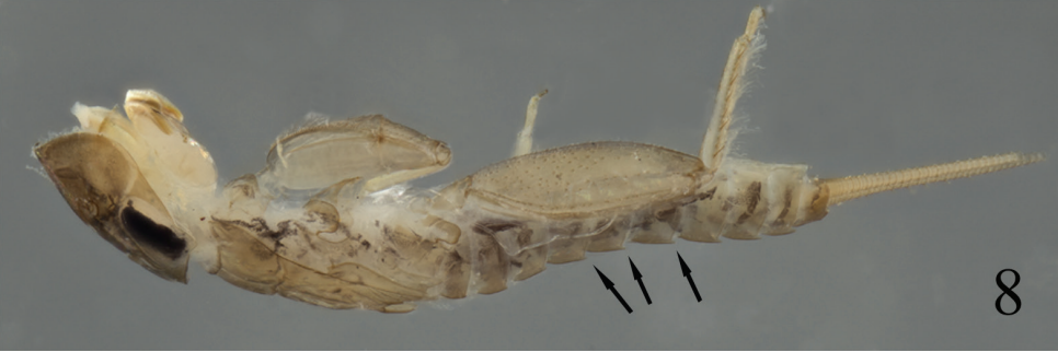
Figures 7–8. Epeorella vadora (Webb & McCafferty, 2007), comb. n. 7 Nymph paratype in dorsal view 8 Nymph paratype in lateral view with median abdominal ridge (arrows).

of Epeorella , and is considered as a subjective junior synonym of Epeorella syn. n. The species Epeorella vadora comb. n. is retained as a valid species because it exhibits a different colour pattern of the abdomen.