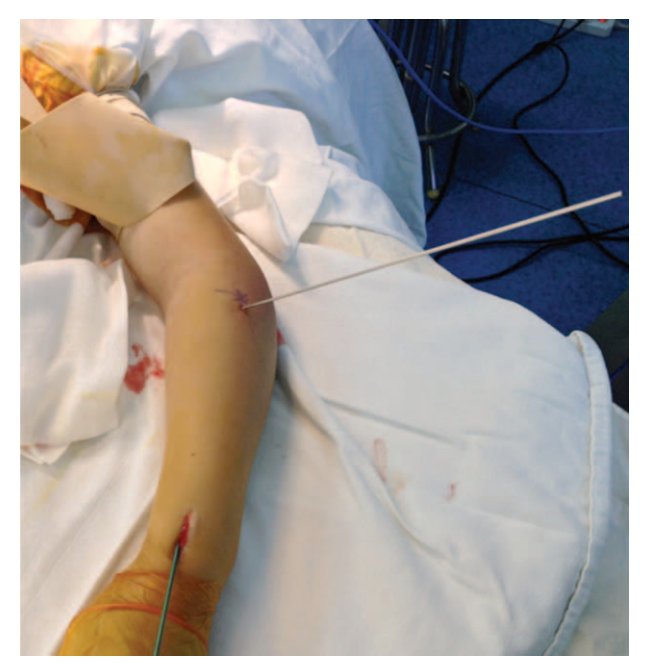
FIGURE 2. The view of percutaneous K-wire leverage and closed intramedullary pinning in a 8-year-girl with a Judet grade III radial neck fracture.

lines in 3 of 4 cortices on both anteroposterior and lateral radiographs of the elbow. Pain of the elbow was assessed using the Numerical Pain Rating Scale. Stability of the elbow was graded using varus–valgus stress. Elbow functional recovery was assessed using the Mayo Elbow Performance Index, and was graded as excellent, good, fair, and poor according to the criteria proposed by Tibone and Stoltz.<sup>3</sup>