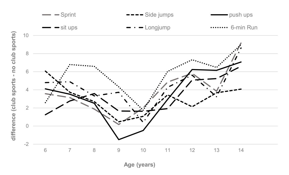
Figure 3. Mean difference in age- and sex-standardized scores between club sports and non-club sports participants on individual fitness tasks across the ages 6–14 years.