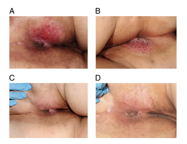
Figure 1: (A) Initial presentation with an erythematous perianal lesion with associated superficial excoriation. (B) Appearance of rash following 5 weeks and (C) 16 weeks of treatment with 5% imiquimod cream, demonstrating stepwise improvement. (D) Appearance of perineum at 6-month follow-up following completion of treatment.

Breast and gynaecological examinations of the patient were normal, while a colonoscopy did not identify any evidence of extramammary bowel disease. A computed tomography (CT) chest, abdomen and pelvis demonstrated subcutaneous