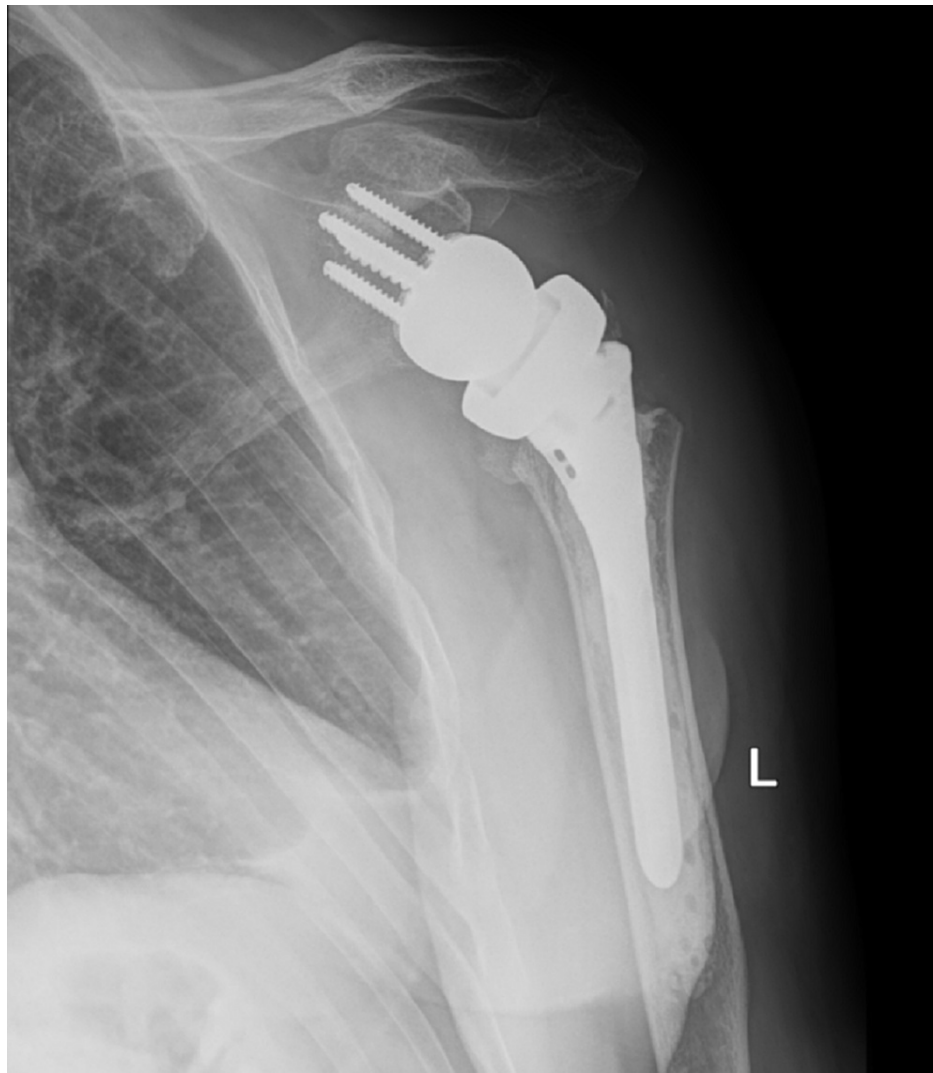
FIGURE 7: AP postoperative radiograph of the left shoulder at 12 weeks demonstrates a reverse total shoulder arthroplasty (rTSA) in satisfactory alignment without signs of loosening or failure.