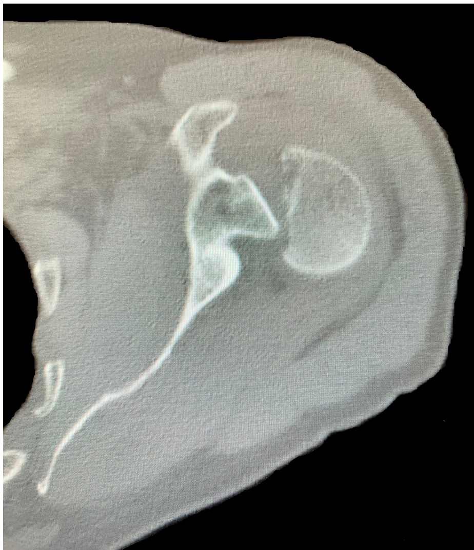
FIGURE 1: Axial view of preoperative computed tomography (CT) scan of the left shoulder demonstrating a four-part proximal humerus (PH) posterior fracture-dislocation.