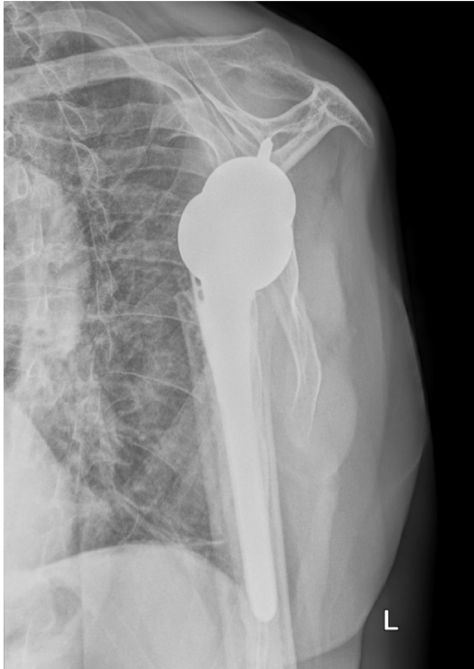
FIGURE 8: Scapular Y postoperative radiograph of the left shoulder at 12 weeks demonstrates a reverse total shoulder arthroplasty (rTSA) in satisfactory alignment without signs of loosening or failure.