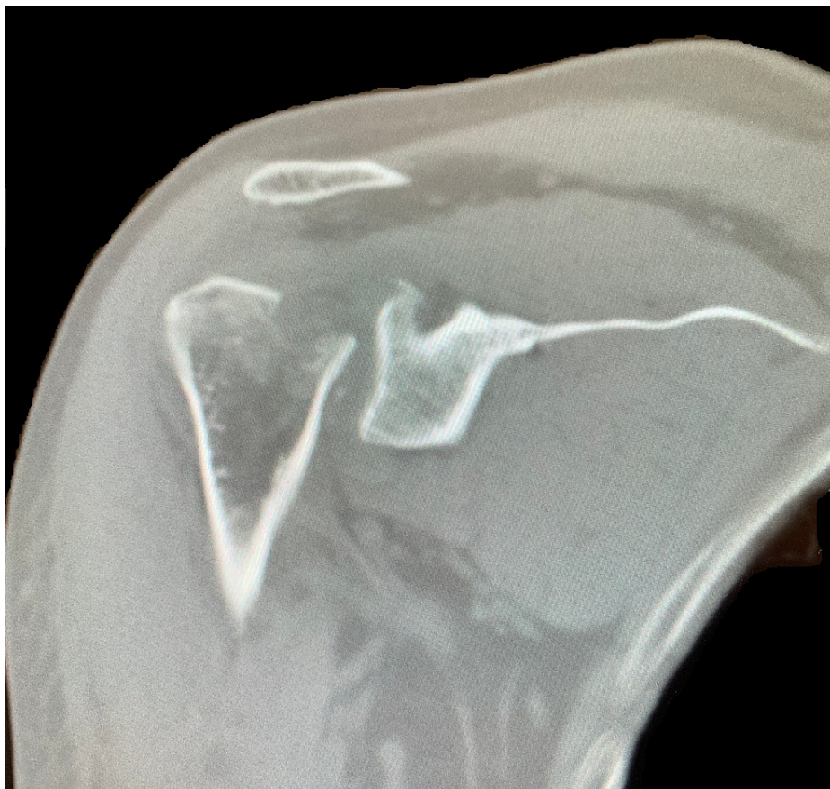
FIGURE 5: Coronal view of preoperative CT scan of the right shoulder demonstrating a four-part proximal humerus (PH) posterior fracture-dislocation.