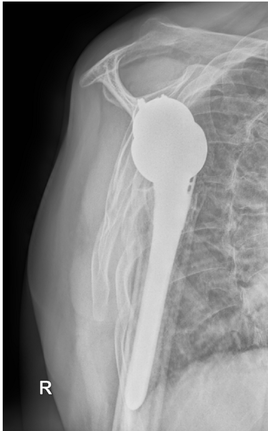
FIGURE 10: Scapular Y postoperative radiograph of the right shoulder at 12 weeks demonstrates a reverse total shoulder arthroplasty (rTSA) in satisfactory alignment without signs of loosening or failure.

It is unclear whether daily PPI use, chronic alcohol use, and/or tobacco use put the patient at risk for fracture, but these may have been contributing factors. The etiology of his seizure was also unclear but may have been associated with the reported seizure threshold lowering effects of PPIs [6].