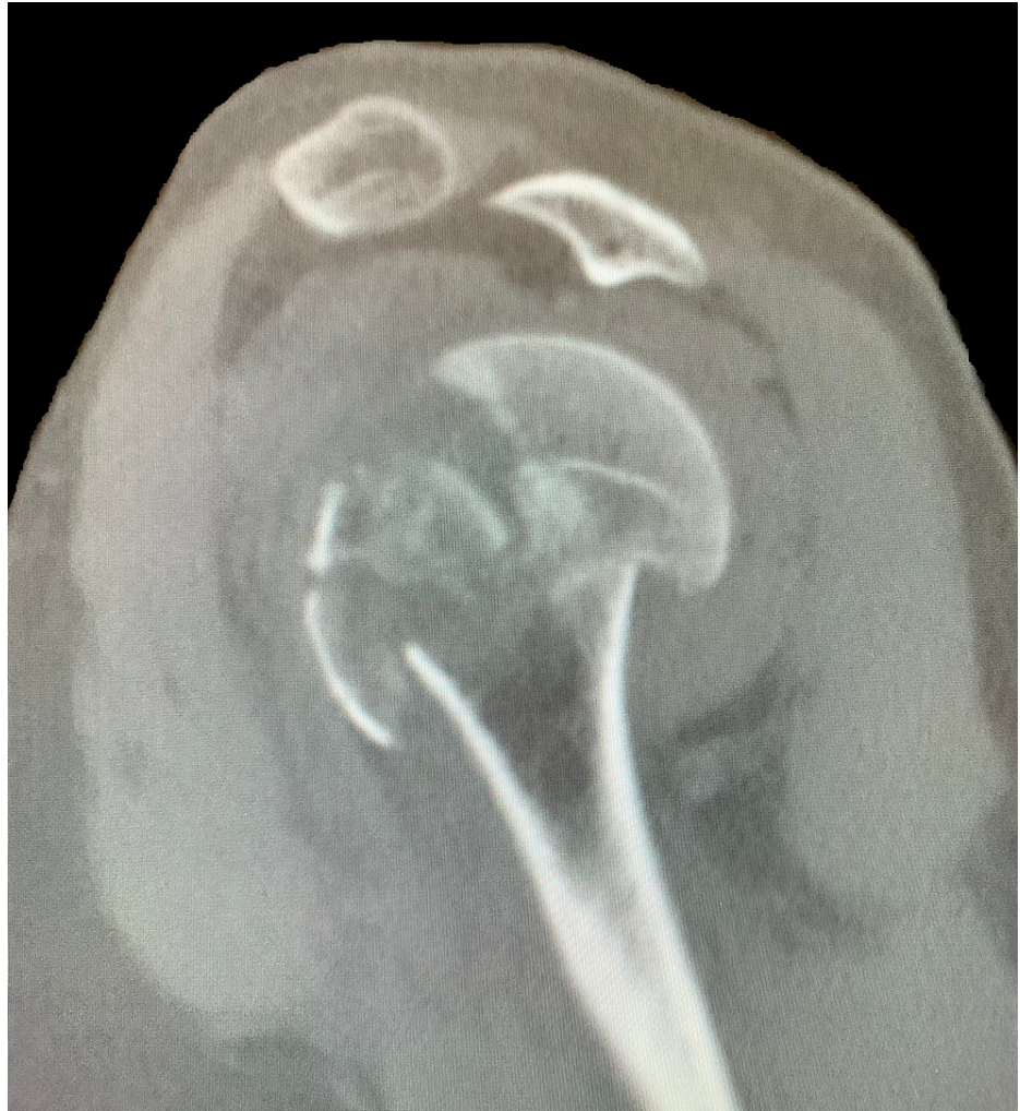
FIGURE 3: Sagittal view of preoperative CT scan of the left shoulder demonstrating a four-part proximal humerus (PH) posterior fracture-dislocation.