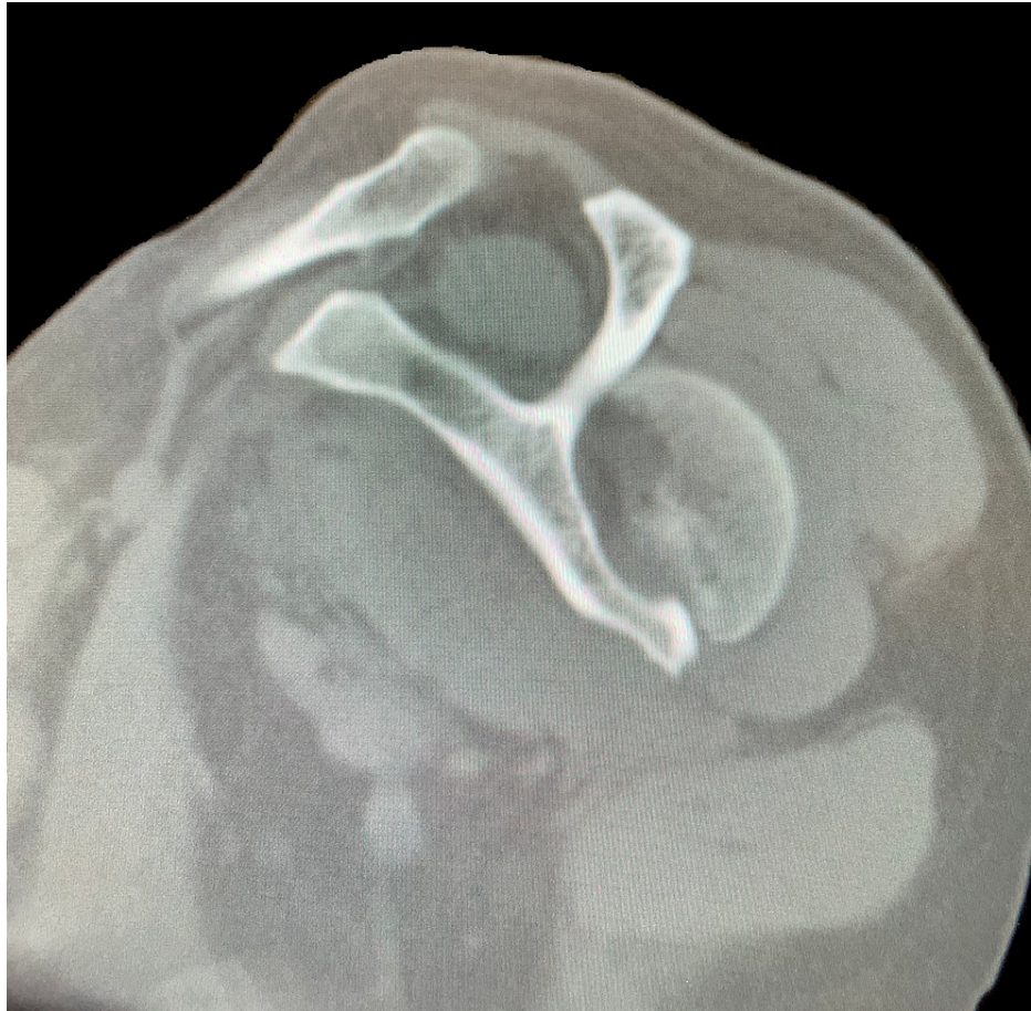
FIGURE 6: Sagittal view of preoperative CT scan of the right shoulder demonstrating a four-part proximal humerus (PH) posterior fracture-dislocation.

The decision to proceed with bilateral reverse total shoulder arthroplasty was made because the patient's rotator cuffs were retracted and atrophied. He had also been experiencing a significant amount of glenohumeral arthritis before the seizure. He underwent staged reverse total shoulder arthroplasties, the first being the right side, his dominant hand, which was performed six days post-injury. The subsequent second stage was performed on the left side 10 days post-injury. He tolerated both procedures well and had an uneventful postoperative recovery. The patient completed physical therapy programs for both shoulders, and he was compliant with all follow-up appointments. At a one-year follow-up, the patient's range of motion was equal in both shoulders: forward flexion to 120 degrees, abduction to 120 degrees, external rotation to 50 degrees, and internal rotation to L4. He was very pleased with his operative outcome. Postoperative radiographs of the bilateral shoulders obtained at 12 weeks postoperatively are seen in Figures 7-10. These images demonstrate bilateral reverse total shoulder arthroplasties in satisfactory alignment without evidence of loosening or hardware failure.