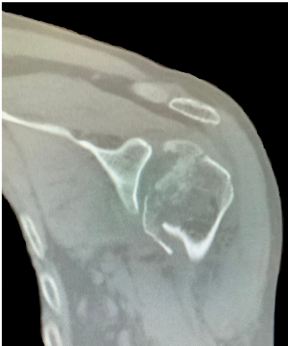
FIGURE 2: Coronal view of preoperative CT scan of the left shoulder demonstrating a four-part proximal humerus (PH) posterior fracture-dislocation.