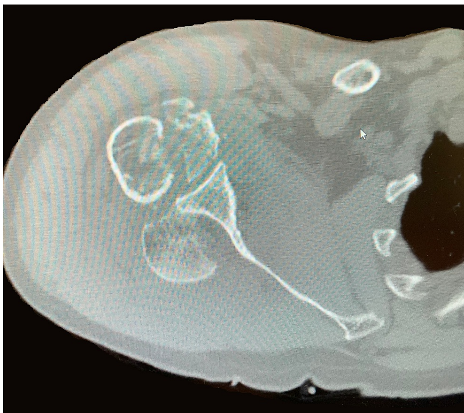
FIGURE 4: Axial view of preoperative CT scan of the right shoulder demonstrating a four-part proximal humerus (PH) posterior fracture-dislocation.