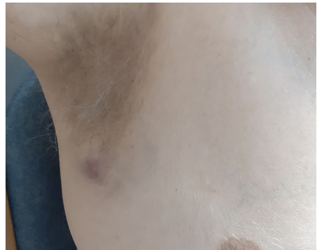
Fig. 3 – Clinical photography of the right axillary lesion prior to surgery.

Sebaceous carcinoma is a rare malignant tumor of the sebaceous glands and extra-ocular lesions typically present as a painless skin lesion often involving the subcutaneous tissues. [4]. SC is referred to as the ‘great masquerader’ and differential diagnosis includes several inflammatory conditions as well as other tumors [5]. The differential diagnosis of a sebaceous carcinoma includes benign sebaceous (epidermoid) cysts, and the very rare skin malignancies of dermatofibrosarcoma protuber-