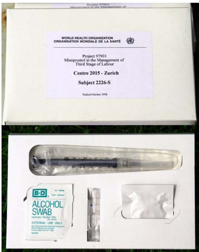
Figure 1 Treatment pack