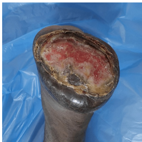
Before initiation of treatment