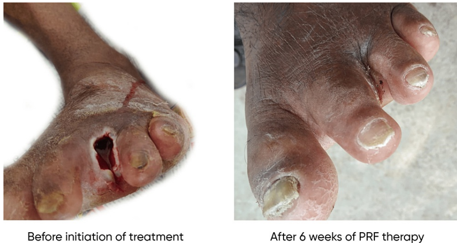
FIGURE 4: Patient 2 with nonhealing ulcer after ray amputation of the third toe before and after treatment with PRF