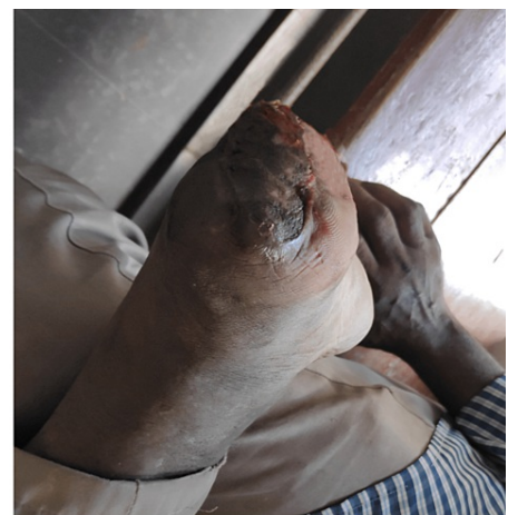
After 6 weeks of PRF therapy