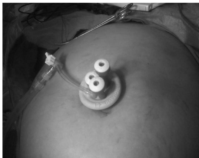
Figure 2. Covidien SILS port.