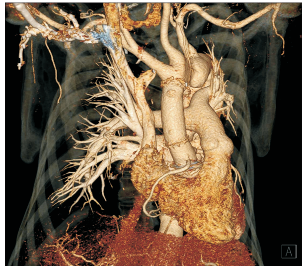
Fig. 3. Postoperative computed tomography angiography shows 2 well-enhancing separate coronary arteries and the absence of the root aneurysm.

perfusion through the innominate artery was maintained during total circulatory arrest (TCA). Hemi-arch replacement was performed using a 24-mm Gelweave 1-branched graft (Vascutek, Inchinnan, UK). After completing distal aortic anastomosis, cardiopulmonary bypass was restarted using the branched graft as an arterial inflow site. The patient was subsequently rewarmed. After removing the old graft and mechanical valve, which contained a thrombus and subvalvular pannus, the coronary arteries and aneurysms were examined. Since the aneurysmal change was in the common coronary button, the anomalous RCA had sufficient length for a separate anastomosis, excluding the stenotic intramural ostium. A 23-mm composite valve conduit (St. Jude Medical Inc., St. Paul, MN, USA) was used for the modified Bentall procedure. The left coronary button was prepared and anastomosed to the prosthetic com-