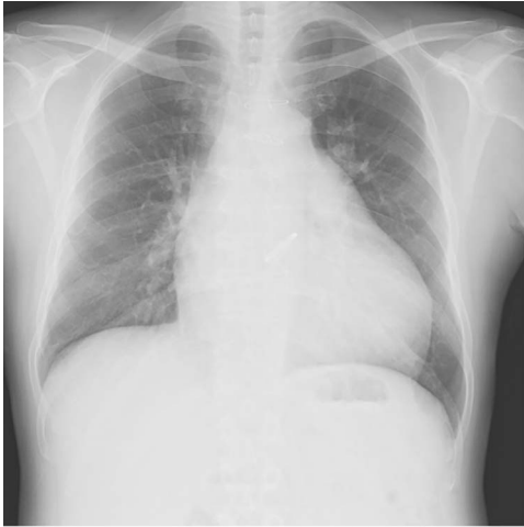
Figure 3: Plain chest radiograph of the first outpatient visit after discharge from the hospital.

of thrombosis with mechanical valves [5]. In the present case, a mechanical valve was used for the aortic position and a biological valve for the pulmonary position to maintain an international normalized ratio of prothrombin time (PT-INR) between 2 and 2.5 for avoiding bleeding complications in the late follow-up period, because PT-INR should be between 3 and 3.5 when mechanical valves are used in the pulmonary position. At the time of surgery, we considered the possibility of future transcatheter pulmonary valve replacement, which is not yet approved in Japan. Webb et al. reported valve-in-valve transcatheter pulmonary valve replacement in six patients; this technique was considered suitable because of the low-pressure system and history of repeated surgery [6].