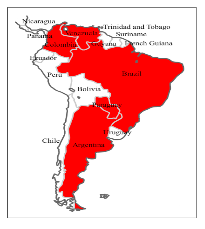
Figure 1. Countries of South America where S. rebaudiana grows spontaneously.

In Paraguay, S. rebaudiana flowers from January to March, whereas in the Northern Hemisphere, the flowering time is between September and December. In its native habitat, the plant occurs mainly in sandy soils; under cultivation, however, the growth and flowering of S. rebaudiana depend on solar radiation, photoperiod, temperature and water availability of the soil [27]. When cultivated under long-day conditions, S. rebaudiana increases the foliar area and the concentration of sweetening glycosides in the leaves [28]. S. rebaudiana , often referred to as the sweet herb of Paraguay , has been widely used in many countries, including China, Japan, Korea, Brazil, and Paraguay, either as a substitute for sucrose in foods and beverages or as a household sweetening agent [29]. The plant is rich in carbohydrates (62% dry weight, dw), protein (11% dw), crude fibre (16% dw), minerals (K, Ca, Na, Mg, Cu, Mn, Fe, Zn), and essential amino acids [30].