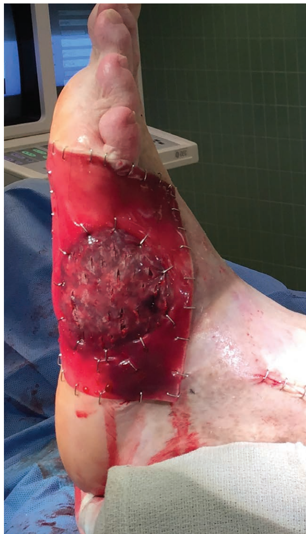
Fig. 2. Representative image of treatment strategy. After the preparation of the muscle flap as a wound cover, a 0.4-mm INTEGRA Bilayer Wound Matrix is applied over the muscle flap. A static circular external fixator is placed onto the lower extremity to allow for offloading of the surgical site and to limit motion across the flap site. Negative pressure wound therapy is applied for 7 to 10 days. Approximately 17 days later, a split-thickness skin graft (0.018 inches) is applied over the INTEGRA Bilayer Wound Matrix for definitive closure. INTEGRA Thin Skin Wound Matrix was placed on the donor skin graft site (not shown).

The fixator was removed at the time of healing. At the time of fixator removal, the limb was considered stable; the wound is fully healed and is not a risk to the limb. An example of the progression of healing up to the time of fixator removal can be seen in Figure 4. The average time to fixator removal was 8.3 weeks (Table 1). At the harvest site, there were hematomas present in 2 patients; 1 hematoma required evacuation. Of the 17 cases, there was 1