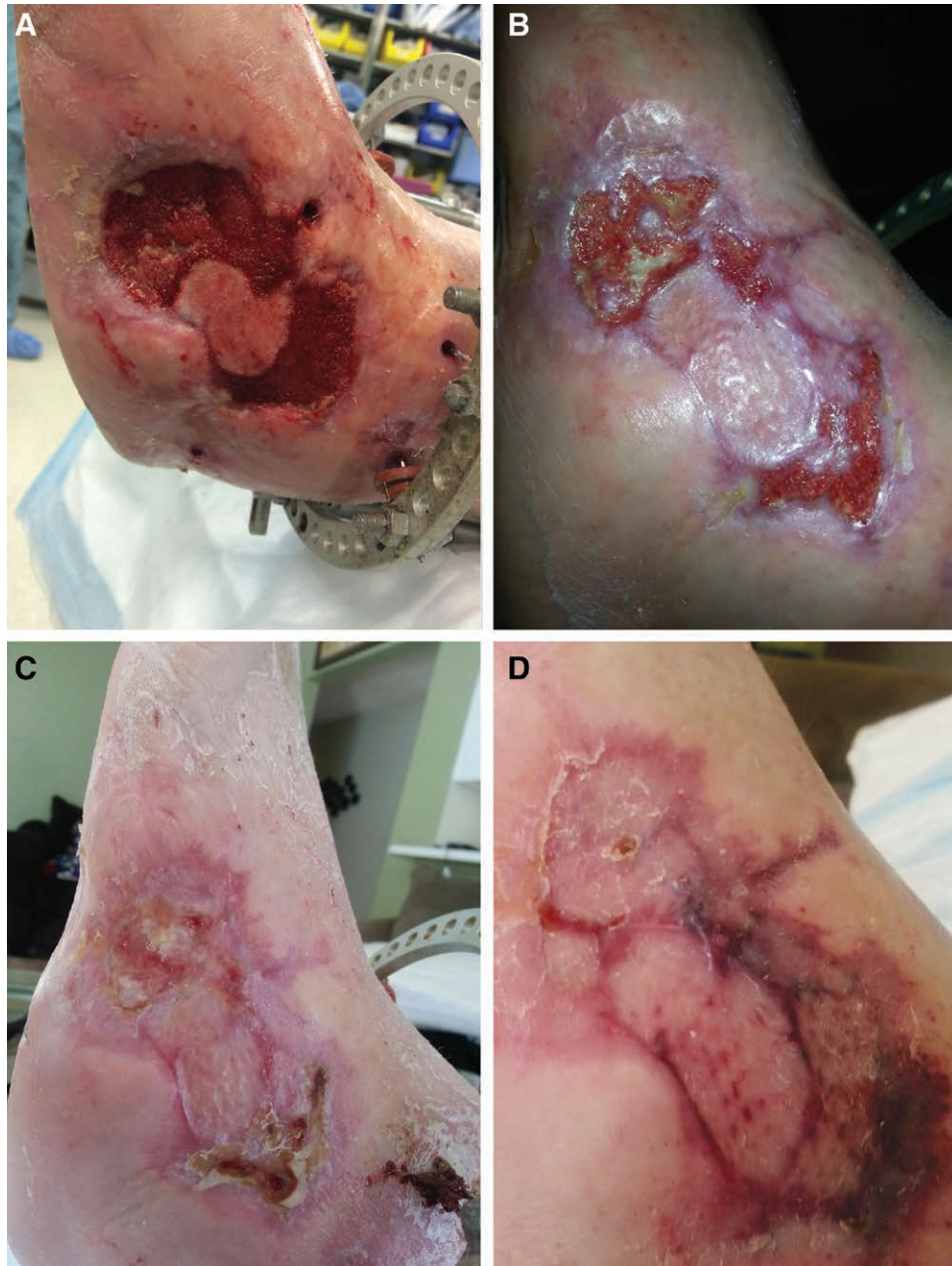
Fig. 4. Images of wound healing progression: (A) 18, (B) 25, (C) 38, and (D) 45 days after surgery.

therapies described here is preferred to ensure sufficient site preparation to allow for better graft take. Nonetheless, given that the wound bed was sufficient for 100% graft take 17 days later, it is likely that this combinatorial approach was effective.