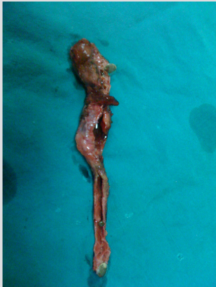
Figure 3. Post-operative specimen showing along cystic duct with a small stone impacted at its proximal end

After haemostasis, a size 16 tube drain was left in the operative bed, and mass abdominal wall closure was carried out. On the second post-operative day, the patient was able to tolerate fluids and a light diet, and his post-operative bloods were all within normal range. The drain only drained 40 ml of serous fluid, so it was removed. The patient mobilized well and was discharged home after 3 days.