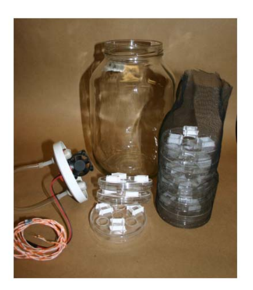
Figure 2. Four liter jar, lid with fan and nylon mesh sleeve with Petri dishes and perforated lids with spacers used to incubate PDA plates of fungal conidia with M. albus volatiles.