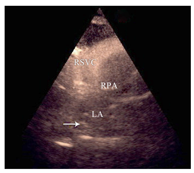
Figure 3. Transthoracic echocardiography in the suprasternal notch view, showing contrast within the dilated RSVC and the entrance of bubbles into the LA (arrow), ruling out an unroofed coronary sinus and a persistent left SVC.

LA, Left atrium; RPA, Right pulmonary artery; RSVC, Right superior vena cava; SVC, Superior vena cava