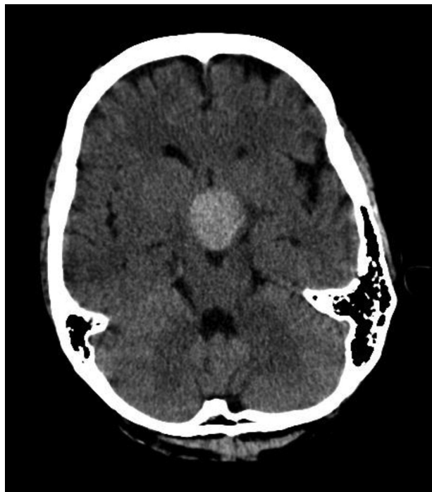
Figure 6 Head computed tomography of a patient with pituitary apoplexy. The hyperdense region represents hemorrhage within a pre-existing pituitary adenoma.

The recommended management for pituitary apoplexy is urgent transsphenoidal decompression surgery and high-dose corticosteroid administration. 112 However, a more