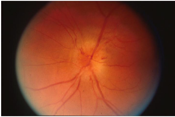
Figure 1 Optic disc edema observed in all cases of acute anterior ischemic optic neuropathy.

gold standard for diagnosing arteritic AION is the temporal artery biopsy. Giant cell arteritis is considered an ophthalmic emergency, requiring the urgent administration of systemic corticosteroids to prevent the development of permanent, bilateral blindness. 18