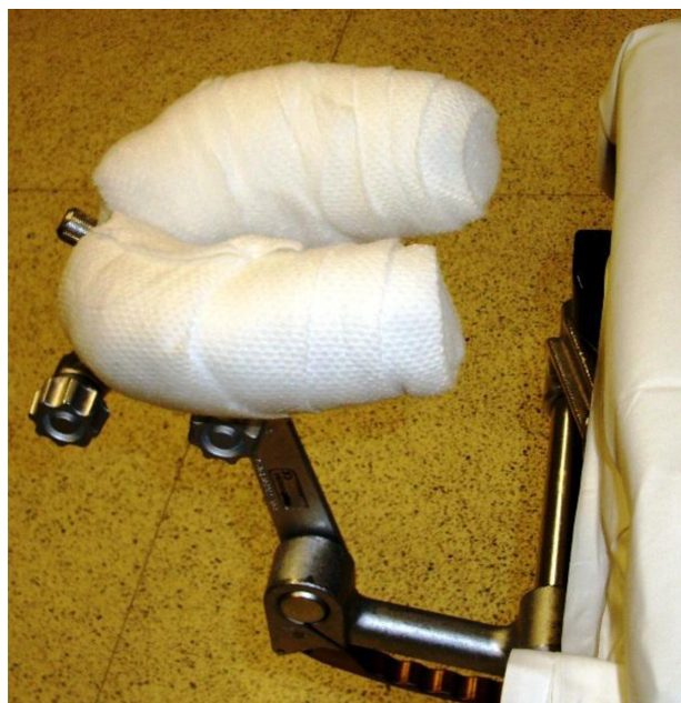
Figure 4 Mayfield headrest used in spine surgery. The edge of the headrest may compress the globe and lead to central retinal artery occlusion.

A study of 37 patients with POVL (including 14 PION and 8 AION patients) following spine surgery found that patients were more likely to have surgical times greater than 6.5 hours and substantial blood loss (3.5 L or more) when compared to age- and surgery-matched controls. Perioperative hematocrit and blood pressure did not differ between cases and controls. This study has been recognized as one of the few comparing hemodynamic factors between cases and controls. However, this study was poorly designed. It included