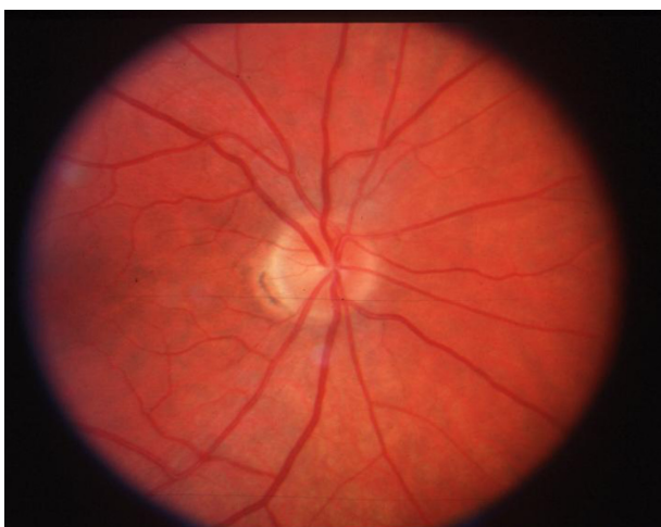
Figure 2 Normal appearing optic disc is seen in all cases of acute posterior ischemic optic neuropathy.

PION is believed to result from infarction to the intraorbital optic nerve, supplied by pial blood vessels. PION is much less common than AION. There are three recognized types of PION: perioperative, arteritic, and nonarteritic; the perioperative type is the most common. 20 PION presents with similar signs and symptoms as AION, and is differentiated from AION based on the presence of a normal optic disc and fundoscopic examination at the onset of visual symptoms (Figure 2). 13 Gadolinium enhancement 21 and/or restricted diffusion 22 may be seen on orbital magnetic resonance imaging (MRI), while the MRI is typically unremarkable in AION.