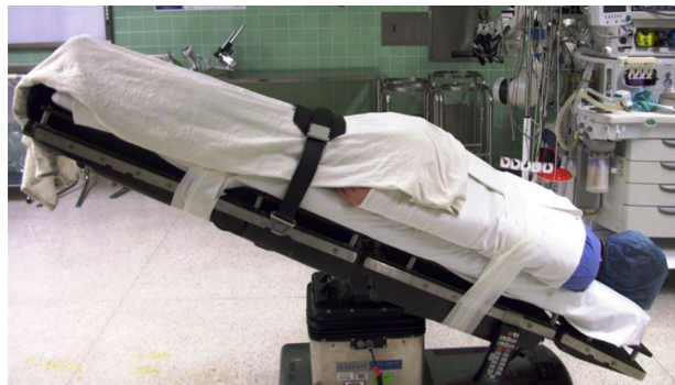
Figure 3 Positioning in spine surgery typically involves the patient lying prone in the Trendelenburg position. The level of the head is below the level of the feet, which leads to facial edema.

Postoperative PION is most commonly seen following spine surgery in the prone position. Prone positioning may lead to increased orbital venous pressure through an increase in abdominal venous pressure, especially when patients are obese. 37 Spine surgery patients are often placed in the Trendelenburg position, which also results in greater orbital venous pressure (Figure 3). Prone positioning may exert excessive pressure on the globe, and has been shown to raise the IOP in both anesthetized 38 and awake 39 patients. The use of a Mayfield headrest can also exert excess pressure on the globe, especially in patients with exophthalmos or a flattened nasal bridge (Figure 4). 40 However, an elevated IOP would be expected to decrease perfusion pressure to the optic nerve head and central retinal artery, resulting in AION or CRAO, rather than PION. 13 However, avoidance of the