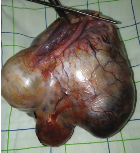
FIGURE 3: The surgical specimen consists of the left ovary. The cyst wall is smooth and glistening.

the ovarian stroma packed around the cyst [7]. Its content is liquid, most often sebaceous type and much more rarely serous type. You can also find hair in the cyst. Quite frequently, a solid nodule is attached to the inner side of the cystic wall, called the Rokitansky nodule or protuberance. It is in this protuberance that the derivatives of 3 layers of stem cells are found: nerve tissue, dander, adipose tissue, gastrointestinal mucosa, etc. The visible hairs within the cyst are derived from this nodule.