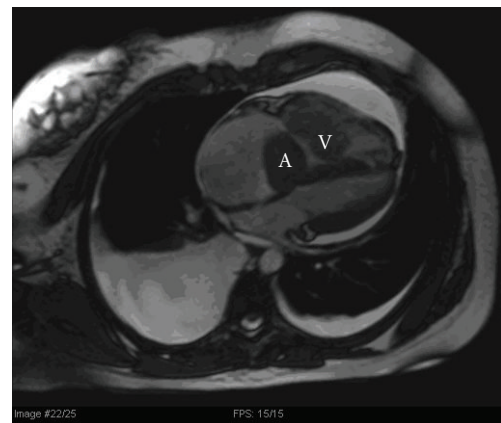
FIGURE 2: White blood 4 chamber view shows bilateral pleural effusions, pericardial effusion, right atrial and right ventricular enlargement. There is a multilobed tumor mass in the right atrium (A) and right ventricle (V).

Sternotomy was performed and as the right hemithorax was entered, multiple nodules were noted on the visceral and parietal pleural surfaces. A right middle lobe and hilar lesion were resected. The heart was inspected and tumor was seen through the epicardial surface between the right atrium and aorta. After entering the right atrium, tumor was noted to be growing from the tricuspid annulus and this was resected