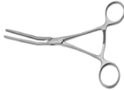
FIGURE 1: Atraumatic DeBakey vascular clamp.

However, it is not obligatory to push the bladder before the procedure. The surgeon and assistant palpate the ureters with both hands in the two sheaths of broad ligament to try to hear a "click" sound, which comes from the ureter sliding out between both fingers. After confirming that the ureters are not in the surgical site, an atraumatic vascular DeBakey clamp (Figure 1) is applied widely on both the infundibulopelvic ligament and the uterine arteries (Figure 2). Thus, two-sided blood supply of the uterus is significantly reduced, which provides time for planning other surgical procedures in a less bloody surgical site. If an avascular state of the surgical site is needed for a prolonged period, while preparing for a blood transfusion or waiting until an experienced surgeon is