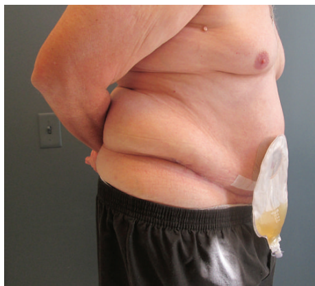
FIGURE 3: Well-healed incisions and uniform contour of abdominal wall six weeks following radical cystectomy with concomitant panniculectomy. The patient experienced good ostomy function and ease of fitting his appliance.

time [9, 10]. Micha et al. [11] also argue that this adjunct can provide surgical treatment options for morbidly obese patients previously thought to be “inoperable.”