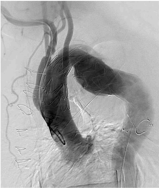
Fig. 3. Post-operative angiography showing stent in the distal ascending aorta, arch and proximal descending aorta. Debranched head and neck vessels were reimplanted to the ascending aorta via median sternotomy.

aerodigestive symptoms [3]. Three scenarios can be considered for surgical management of a Kommerell's diverticulum, depending on extension onto the aorta [5]. Extension into the distal arch, requiring total arch replacement and ligation of the diverticulum. The aneurysmal diverticulum may also extend into the descending aorta, requiring descending aortic replacement via thoracotomy [5]. Lastly, involvement of ascending aorta, arch and descending aortic aneurysmal extension requires extensive graft replacement of involved aorta and diverticulum. Total arch and proximal aortic aneurysm repair is extensive and has higher morbidity when done open compared to hybrid procedure [6]. Type one hybrid procedure with open debranching of arch vessels to the ascending aorta and stent placement in the distal ascending aorta, arch and proximal descending aorta was done (Fig. 3). Factors considered against open repair included the expected morbidity in such a critical patient, anticipated difficulty in accessing the distal arch in a right sided arch, as well as the position of the descending aorta. So more than just one surgical access site would be needed for adequate exposure of the affected vessels. Such complex cases are best managed using a multi-disciplinary approach. However, potential pitfalls include poor judgement of position of proximal landing zone as opposed to left sided arch during endovascular repair.