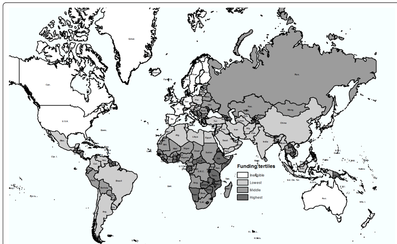
Fig. 1 Geographical distribution of Global Fund support. Countries are shaded according to the tertile of per capita total Global Fund disbursements between 2002 and 2010, from lowest (lightest) to highest (darkest)

Higher Global Fund disbursements per capita were followed by greater declines in adult mortality. Figure 2a shows the temporal pattern of adult mortality by tertile of Global Fund support. The Figure suggests that, prior to the Global Fund, adult mortality was rising among the countries that ended up as the highest recipients, that this rise slowed just prior to start of Global Fund disbursements, and that it changed into a decline following the initiation of support. A similar pattern, though less dramatic, is seen among countries in the middle tertile: rising adult mortality rates followed by a reversal of mortality rates following start of Global Fund disbursements. In contrast, countries at the lowest tertile of support experienced