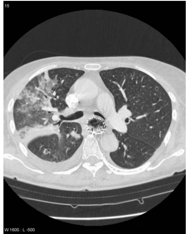
Figure 2. Severe compression of the left main bronchus induced by an esophageal stent. The patient experienced aspiration pneumonia.

Esophageal stent placement. All procedures were performed under general anesthesia. A guide wire was inserted through the fibroscope (Olympus, Tokyo, Japan), across the tumor, and into the distal portion of the esophagus or stomach with fluoroscopic guidance. In severe stricture, a deflated balloon catheter with a 10–12-mm-diameter balloon was then passed over the guide wire to a position across the stricture. The balloon was slowly inflated until the hourglass deformity created by the stricture disappeared from the balloon contour. A metallic covered stent (Ultraflex, Boston scientific, USA) at least 4 cm longer than the stricture was then placed so that its proximal and distal parts rested on the upper and lower margins of the stricture. In case of fistula the covered part of the stent was placed to close the opening. A visual