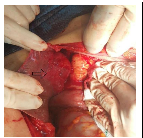
Figure 1: The ruptured hepatic hemangioma is indicated by the arrow