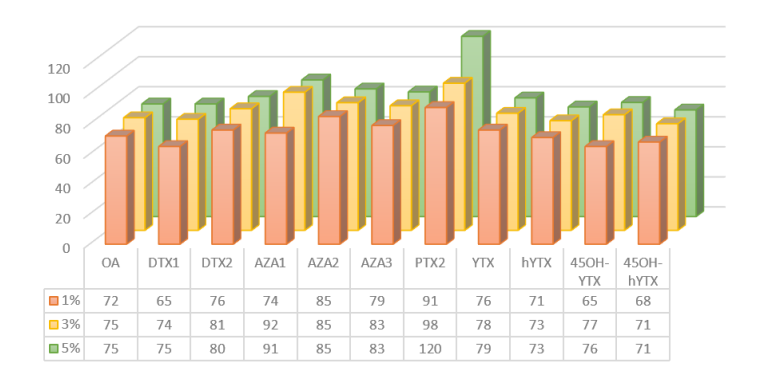
Figure 1. SPE clean-up optimization: comparison of three different methanolic ammonia elution solution (1%, 3%, 5% v/v).