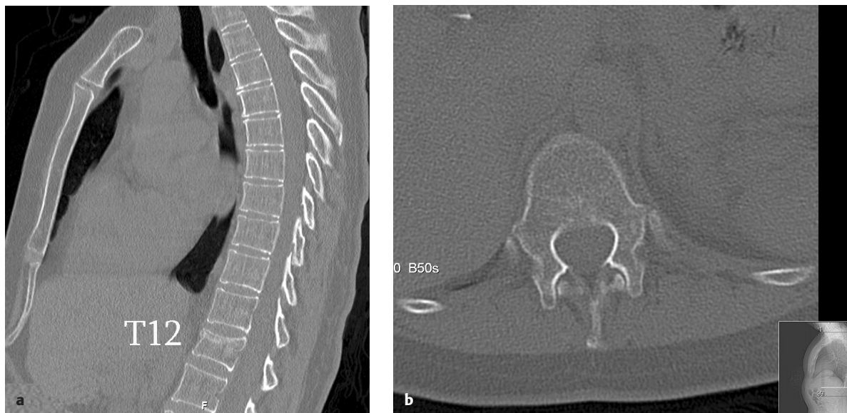
Fig 2a–b Sagittal (a) and axial (b) CT images of Patient 2 demonstrate a burst fracture of T12 with <10% canal stenosis, normal spinal alignment, and no posterior column involvement.