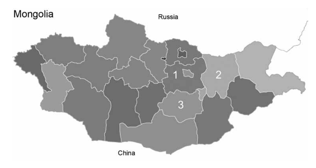
Figure 1. The 3 aimags from which nasal swab specimens were collected from healthy Bactrian camels, for influenza A virus testing, Mongolia, 2012. 1, Töv; 2, Khentii; 3, Dundgovi.

Only 1 specimen was confirmed positive by influenza Aspecific qRT-PCR (cycle threshold [C]<35), suggesting possible virus degradation during shipment, despite specimens being shipped on dry ice and carefully handled upon receipt (10). The original swab specimen from a camel was later shared with the Mongolia National Influenza Center for confirmation in an anonymized panel of 10 camel swab specimens. Using WHO qRT-PCR procedures, staff identified the specimen as having the strongest evidence (by C) of influenza A virus. Staff further studied the specimen with conventional RT-PCR primers and probes for the hemagglutinin and neuraminidase genomes. These reactions yielded amplicons of the expected size, which were sequenced and found to be 100% identical to the corresponding portions of the J. Craig Venter Institute (Rockville, MD, USA) sequences described below.