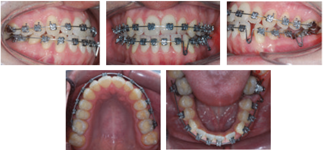
FIGURE 5: Intraoral views of treatment. End of leveling 0.017" x 0.025" stainless steel wire and retraction loops applied to close the extraction space and to correct the midline deviation.