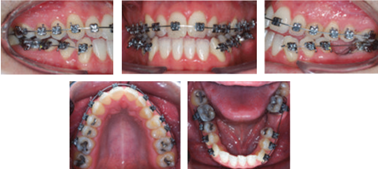
FIGURE 3: Intraoral views of treatment. Start of leveling, extraction of tooth 36, and segmented arch in the lower arch.

The wire sequence adopted for alignment and leveling was 0.014'' NiTi, 0.016'' NiTi, and 0.016'' stainless steel wire. The lower brackets were also bonded on molars and premolars only at this point and after the installation of the 0.017'' \times 0.025'' TMA wire, the lower anterior retraction was performed, only to the left side where tooth 36 was extracted (Figure 3). The use of Class III elastics was indicated at the same time, to facilitate the correction of overjet. In the upper arch, 0.016'' \times 0.022'' NITI wire was used, followed by 0.018'' and 0.020'' bowflex steel arch to expand the left side for transverse adjustment. After achieving sufficient room for the incisors alignment, the lower anterior teeth were bonded (Figure 4). In order to close the extraction space and to correct the midline deviation retraction loops were applied (Figure 5). With the 0.019'' \times 0.025'' stainless steel wire, an elastic chain was used for the mesialization of tooth 37. Tooth 38 was subsequently bonded, and the remaining spaces were closed with an elastic chain (Figure 6). The total treatment duration was 30 months.