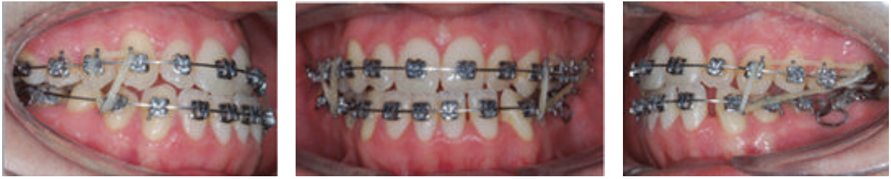
FIGURE 4: Intraoral views of treatment. Bonding the lower incisor, intermaxillary elastics, and loop to start closure extraction space.