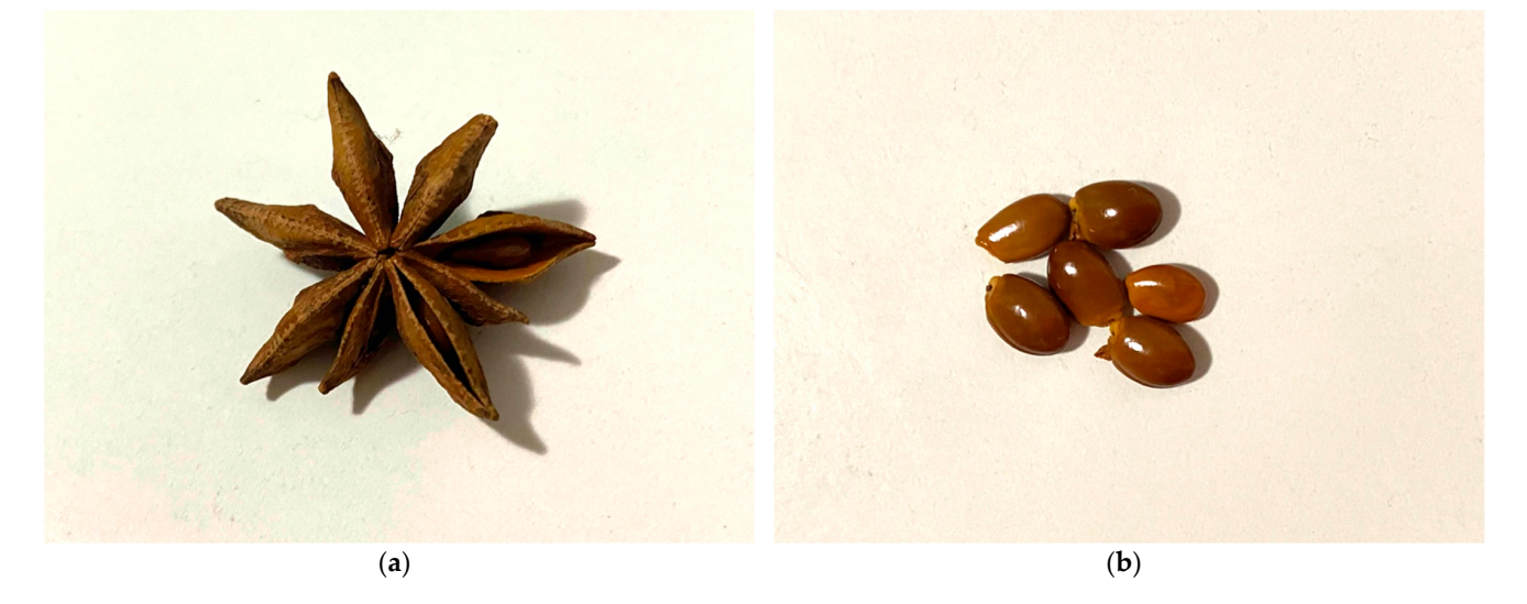
Figure 1. I. verum: (a) dried fruit; (b) seeds.

properties of I. verum and trans -anethole and their potential medicinal and cosmetic applications.