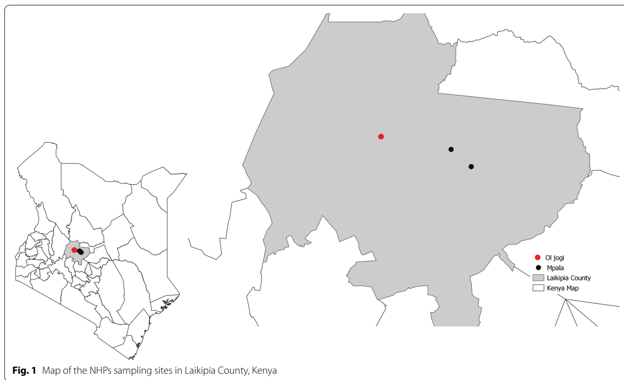
Fig. 1 Map of the NHPs sampling sites in Laikipia County, Kenya