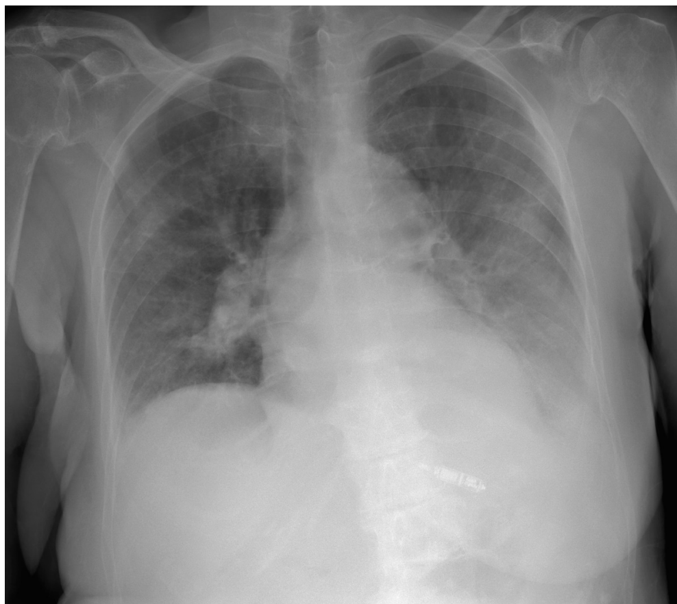
Figure 2. Chest X-ray in posteroanterior view with implanted leadless pacing system in the interventricular septum in the right ventricle.